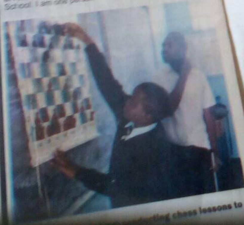
...teaching chess lessons to

In most schools across the country, football, athletics, netball, basketball and volleyball, among others are popular sports among pupils.