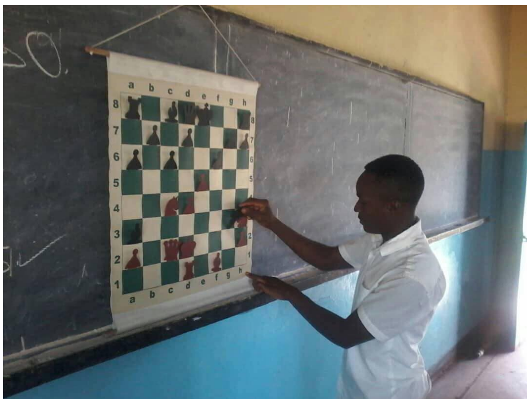
Class Demonstrations Dambo Secondary School