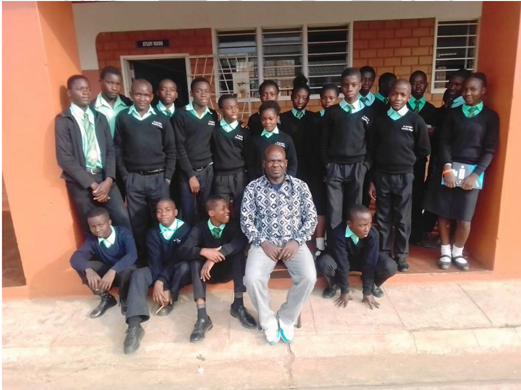
FIDE Certified National Instructor with his chess students