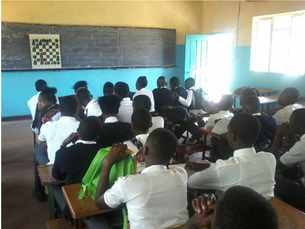
Chess lessons at Masala Secondary School