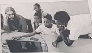
PLAYERS follow the chess game on video.

The average rating for the Bahamas is 1,735 which