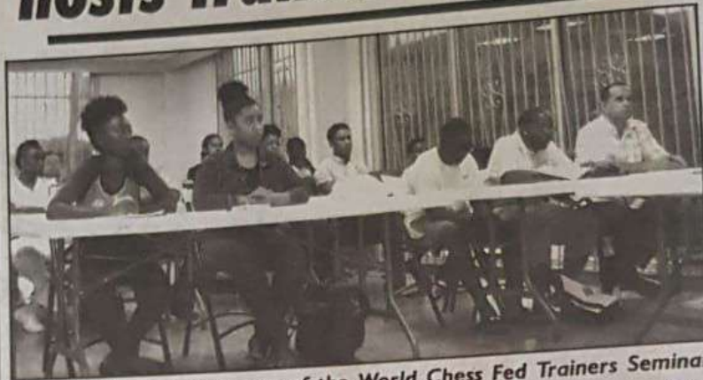
● LISTEN-UP: Participants of the World Chess Fed Trainers Seminar

★ ANOTHER milestone has been achieved by the Bahamas Chess Federation (BCF). The BCF, in partnership with the Ministry of Education, Ministry of Youth, Sports & Culture and FIDE, hosted a free World Chess Federation (FIDE) Trainers Seminar.