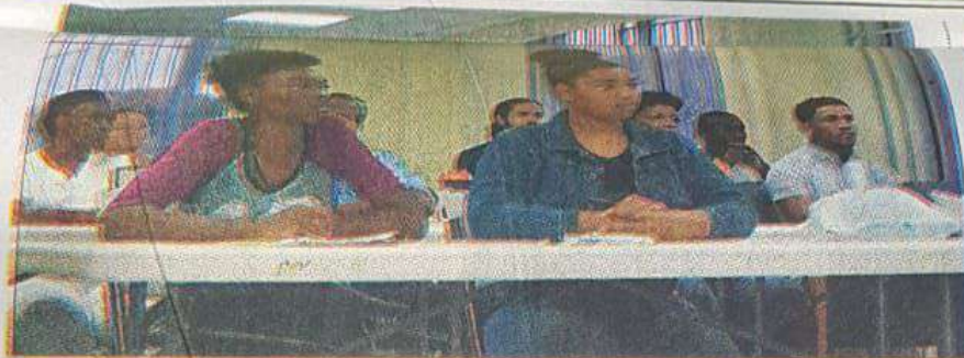
Participants at the World Chess Federation (FIDE) Trainer's Seminar.