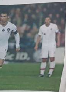
during the Euro 2020 group B qual- ifier against Lithuania, yesterday.

Jonathan Ikone's pass behind the defence for his third goal in two France games.