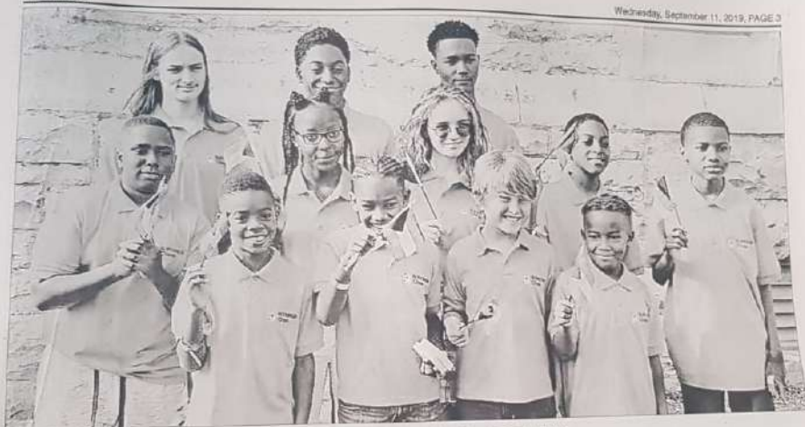
TEAM BAHAMAS: Members of the Bahamas junior chess team.