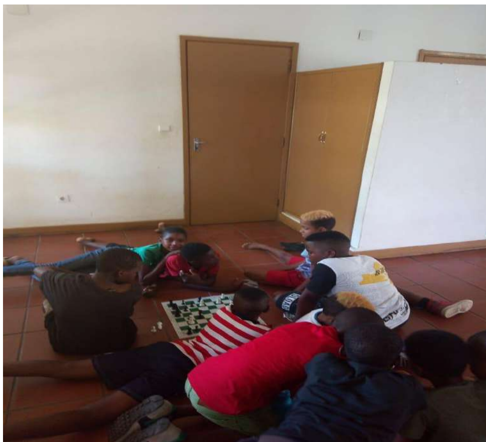
Photo .3 Kids recently introduced to the game of Chess

For the community we started by bringing the kids together and putting one instructor for them, the results are the interest for the game is growing and soon Champions will come.