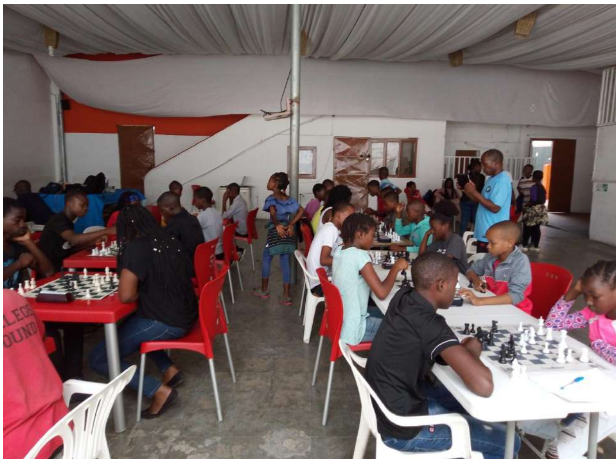
Photo 4. Tournament for young players

The tournament among the kids learning the game is part of the plan and so far, we have organized 2 Tournaments in Maputo and Gaza. We expect to organize more tournaments in 2020.