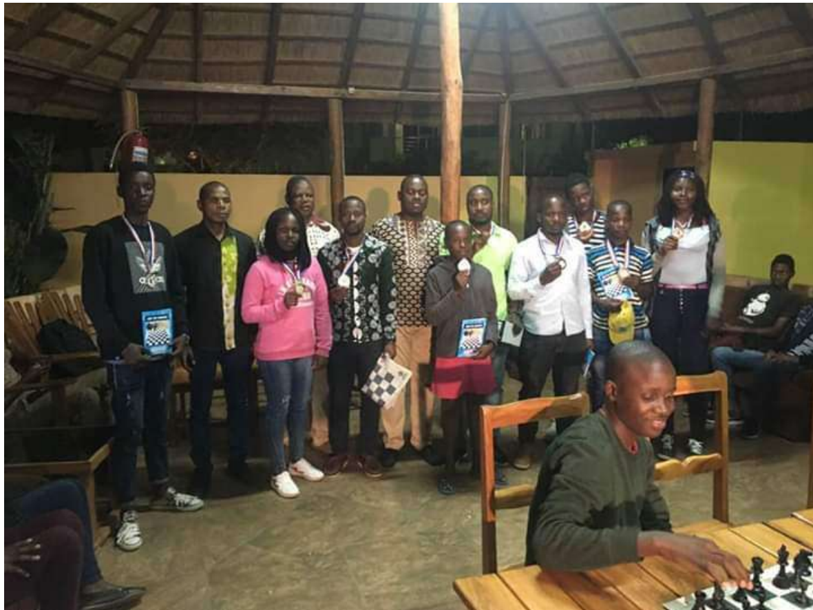
Photo 1. The Mozambican Chess Federation offering Chess Books and sets in Gaza Province and Medals to winners of the Tournament Organized for the event.

The Chess Associations are responsible for organizing local Championships with the first two players going to the Zone Championship and Then the National Championship. Each Chess Association got 20 Chess boards and sets which are going to help bring more players to the game.