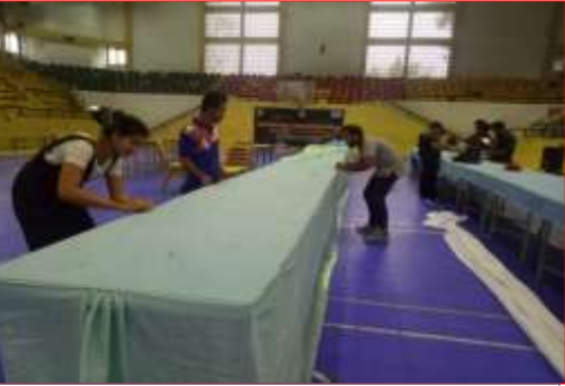
The Organizing Committee is preparing the tables for the competitions