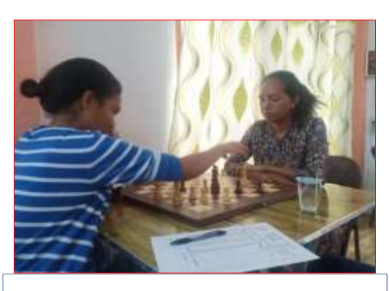
Game during Women's Chess Championship