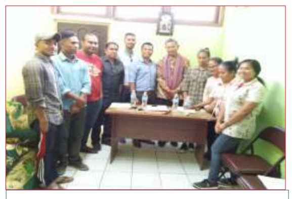
Group Photo with the Chess Trainer