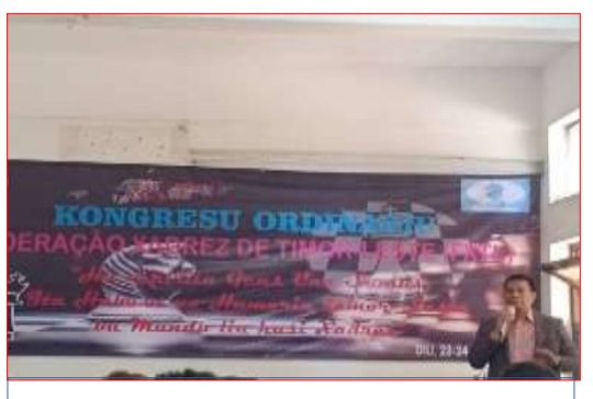
The re-elected President of FXTL on his speech