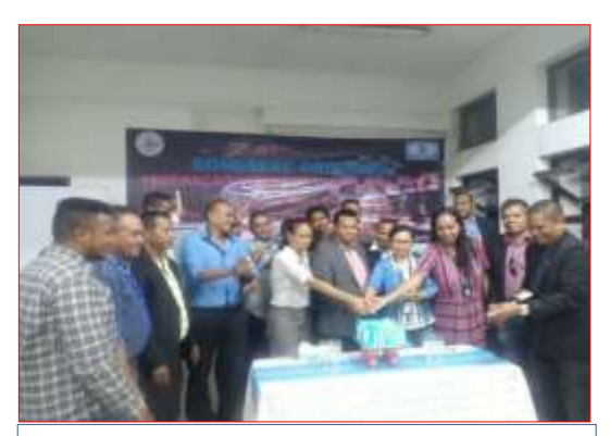
Celebration after the Swearing-in Ceremony for Newly Elected FXTL Structures