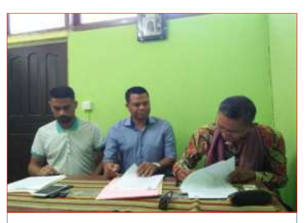
Signing of Agreement on the Chess Trainings