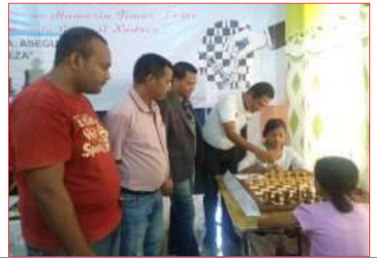
First move made by the Executive Secretary of National Sport Commission of SEJD