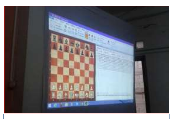
Training Process by utilizing Fritz 13