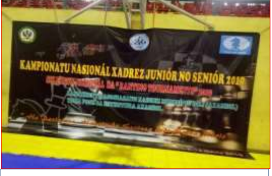
Banner for National Chess Championships 2019

Rua Formosa, Municipio Dili, Tlf+670 77402006/ 73040303/ 77894294 E-mail: ztilman1411@hotmail.com