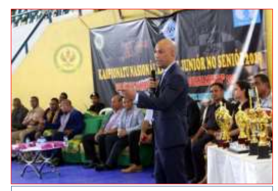
H.E. the Secretary State of Youth and Sport Delivering speech at the Opening