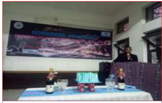
The Executive Secretary of the Sport National Commission of Timor-Leste on his speech