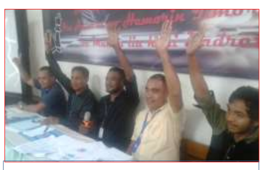
Chair of the General Assembly during voting process