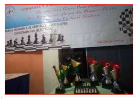
The Trophy for the Timor-Leste Second Rating Tournament