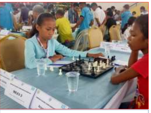
Games amongst Junior Women/Girls