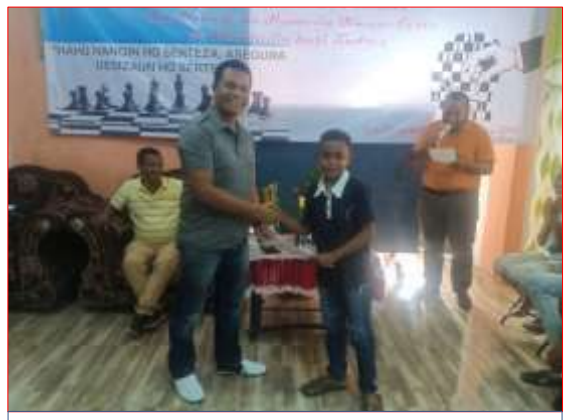
Prize Giving Ceremony of the Third Rating Tournament