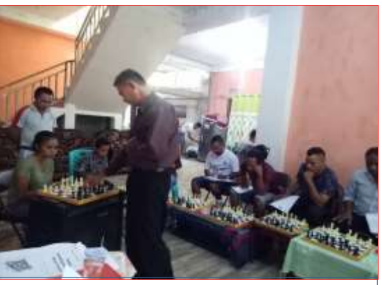
The Trainer is on Simultaneous Games during trainings