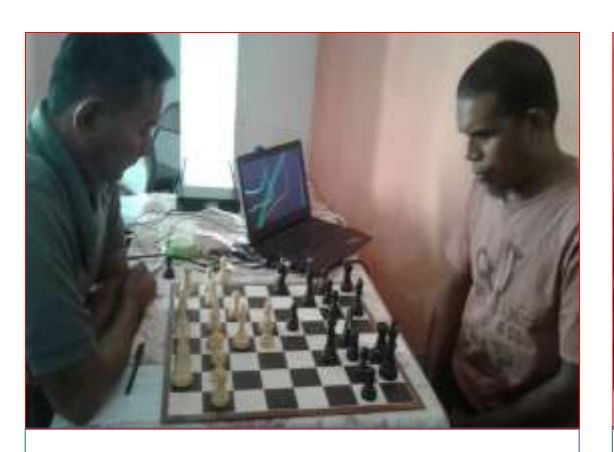
Some Chess coaching to rated Players