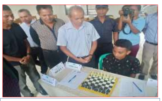
The Administrator of the Maliana Sub-district on the first move