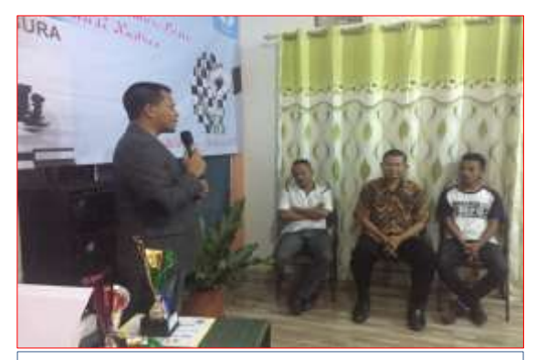
Prize Giving Ceremony on the Second Rating Tournament