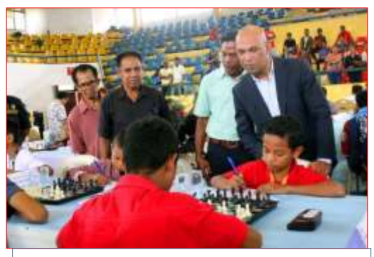
S.E SEJD Observing Games between Junior Men/ Boys