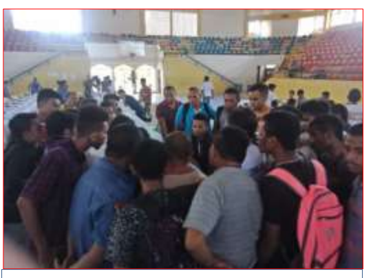
Some final games attracted spectators