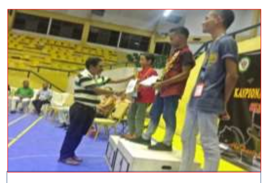
General Director of the National Parliament of Timor-Leste on Prize Giving Ceremony