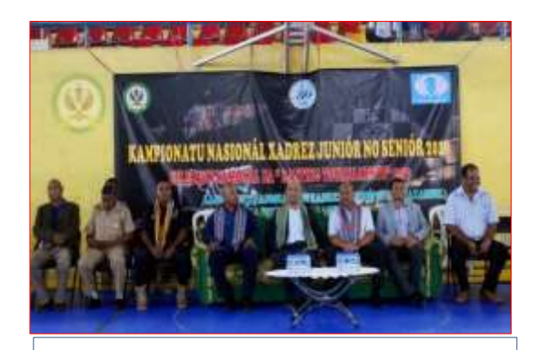
All the Guest of Honors in the Opening