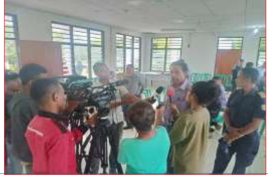
National TV is interviewing the President of AXAMBO