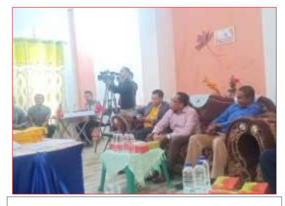
Opening Ceremony on the Rating Tournament