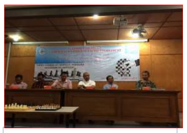
Official Opening of Chess Training