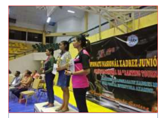
Winners of Senior Women