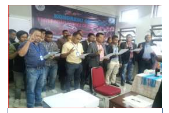
Swearing in of the elected structures