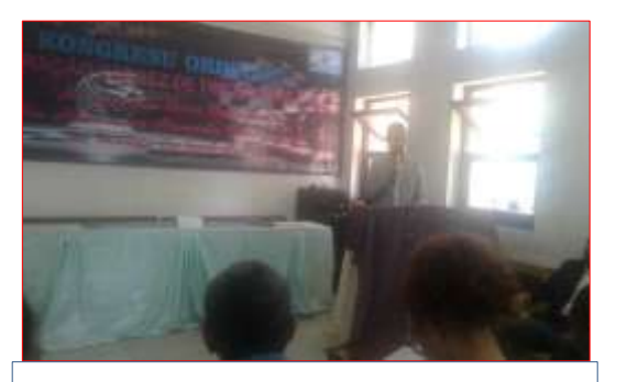
President of the Organizing Committee on his Activity Report