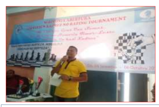
The President of FXTL is on his speech during Prize Giving Ceremony