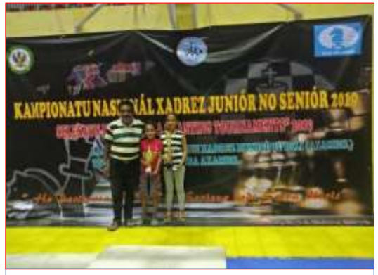
Winners of Girls