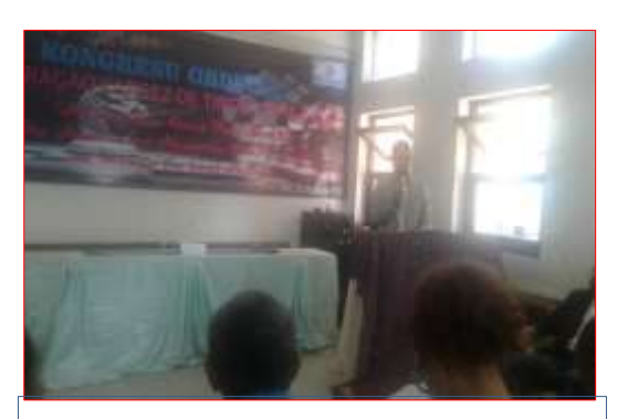
The President of Organizing Committee for General Assembly on his report

Rua Formosa, Municipio Dili, Tlf+670 77402006/ 73040303/ 77894294 E-mail: ztilman1411@hotmail.com