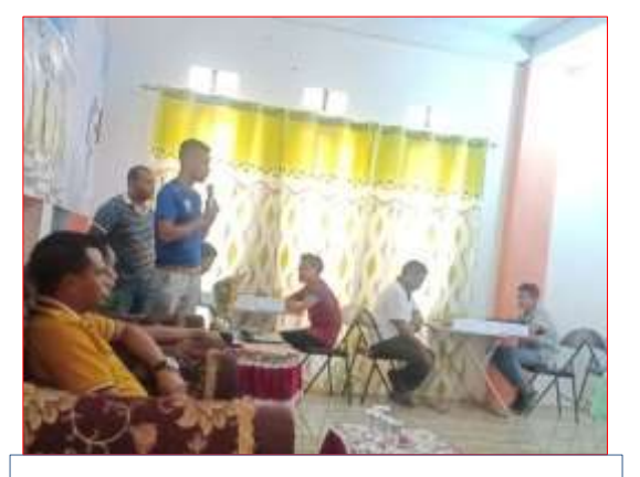
The President of Organizing Committee is on his Remarks