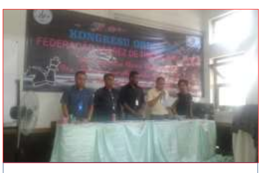
The Secretary of Chair announcing the result of the Election