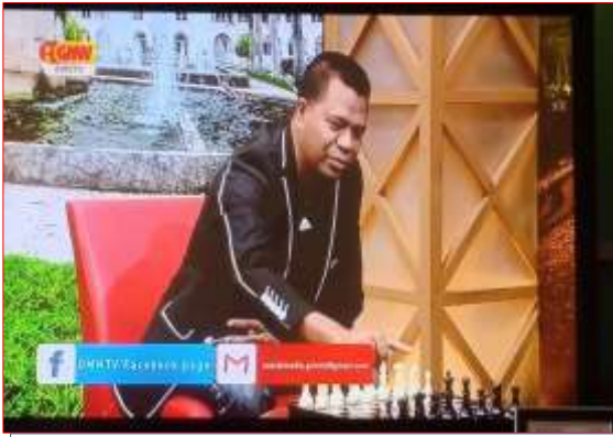
The President of FXTL is on Live National TV Interview