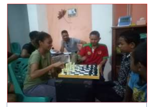
Some Coaching to Junior players