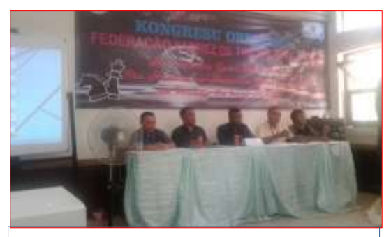
The Chairs of the General