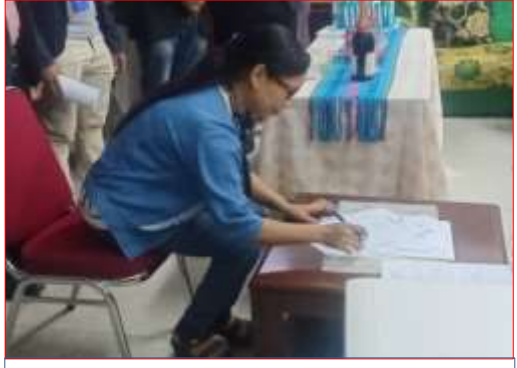
Signing of Swearing in Terms