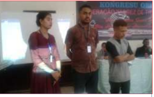
Composition of Verification Team