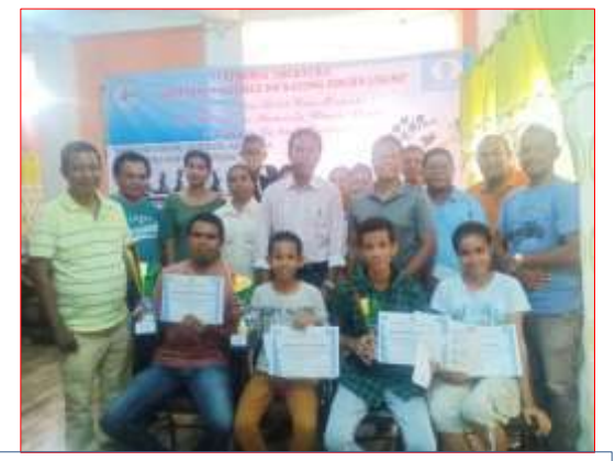
Group Photos with the Third Rating Tournament Participants