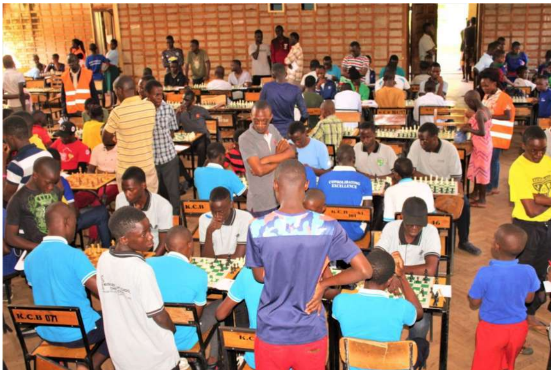
Open section secondary school