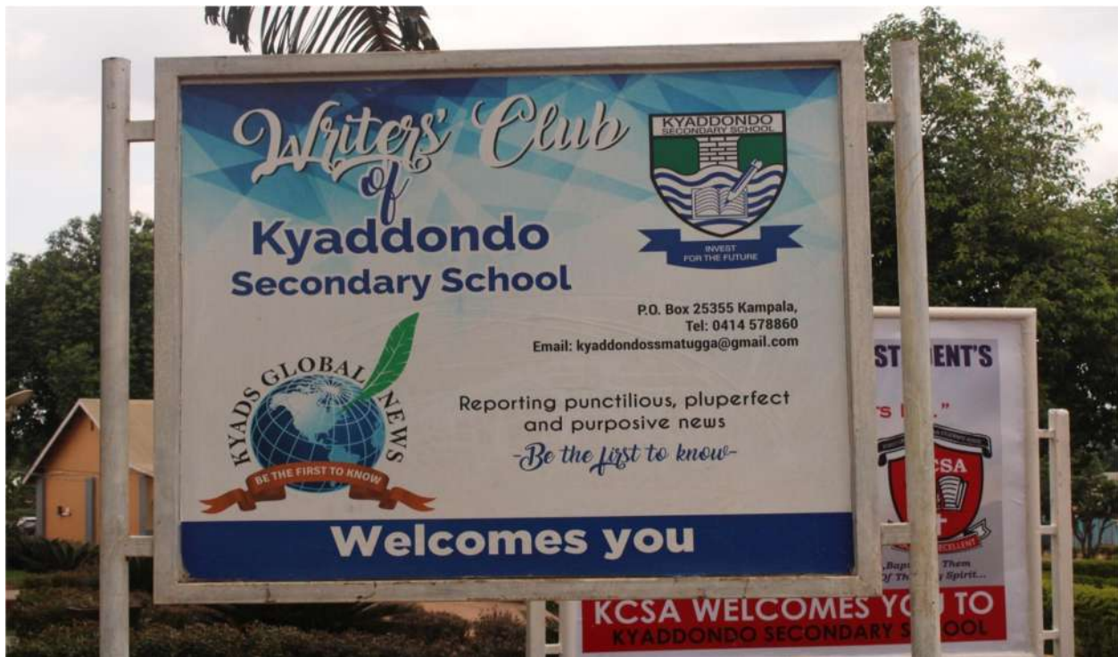
The kyadondo secondary school was one of the several visited by UCF prior to the national schools chess championship.