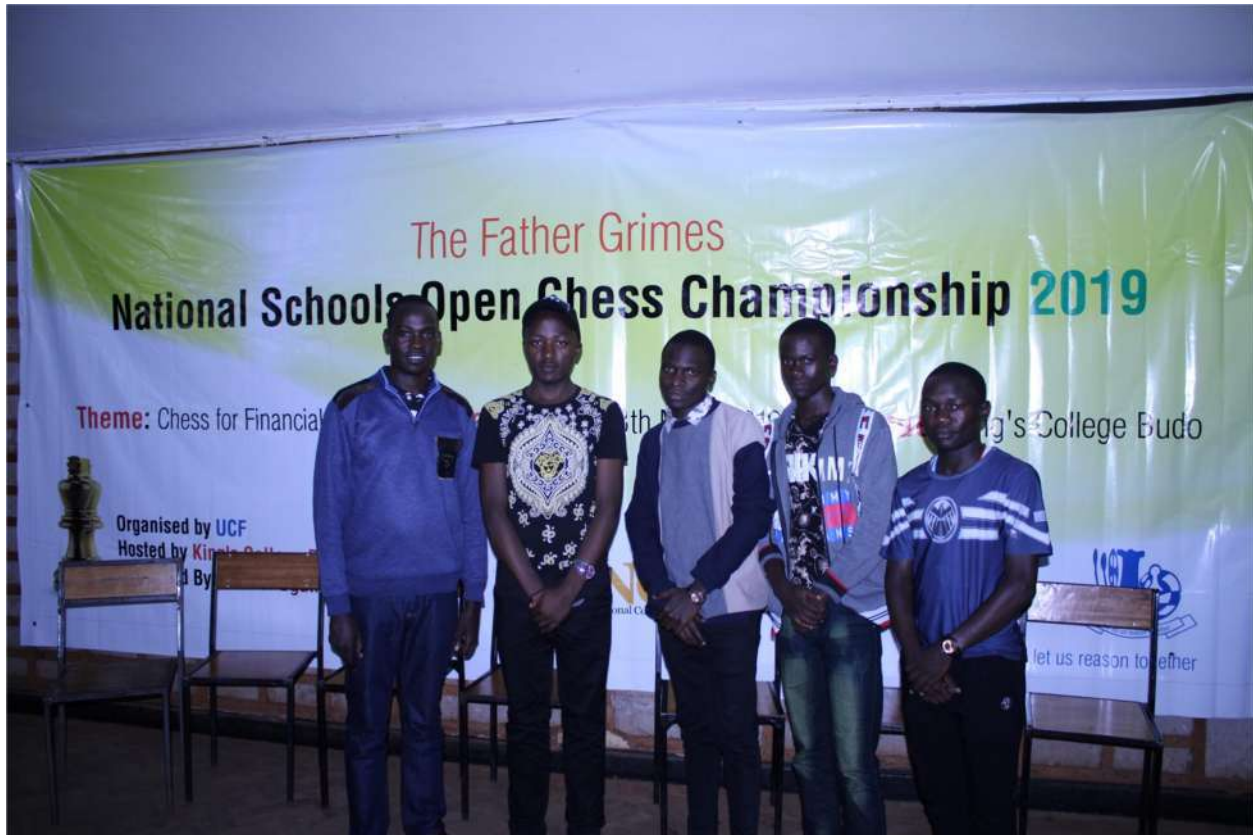
Participants at the 2019 edition of the Father Grimes National Schools Chess Championship.