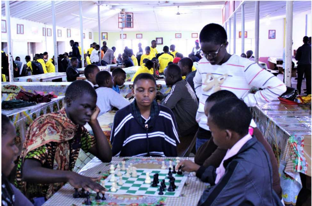
Players analyzing chess positions in the dining area.

The tree shade provided sufficient cover from the sun and in case of bad weather, players reverted to the dining area.