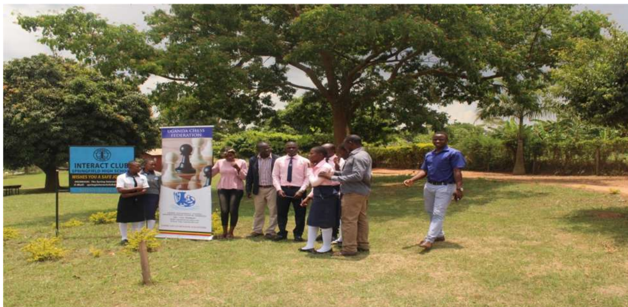
UCF members share a picture moment with Springfield high school students while at the school premises.