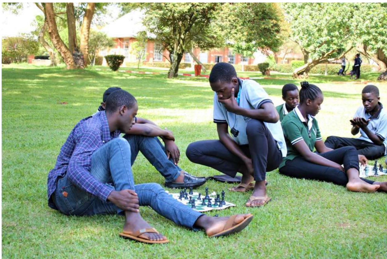
Great compound at the king's College Budo.