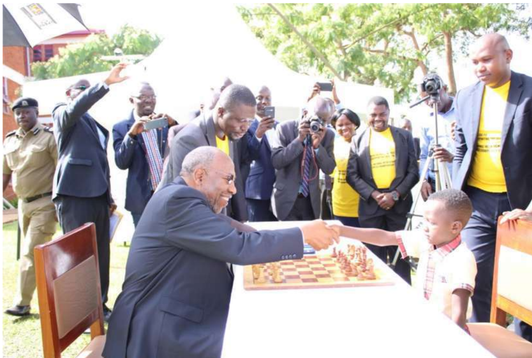
Guest of honor was impressed by the level of play of the young stars in Uganda were playing