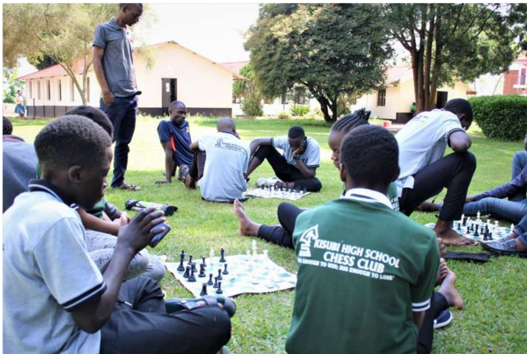
Students of Kisubi High training.