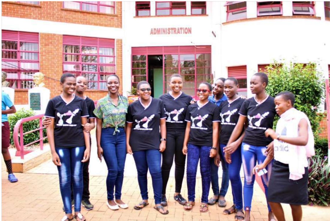
Students of trinity College Nabbingo Share a picture moment with their captain.