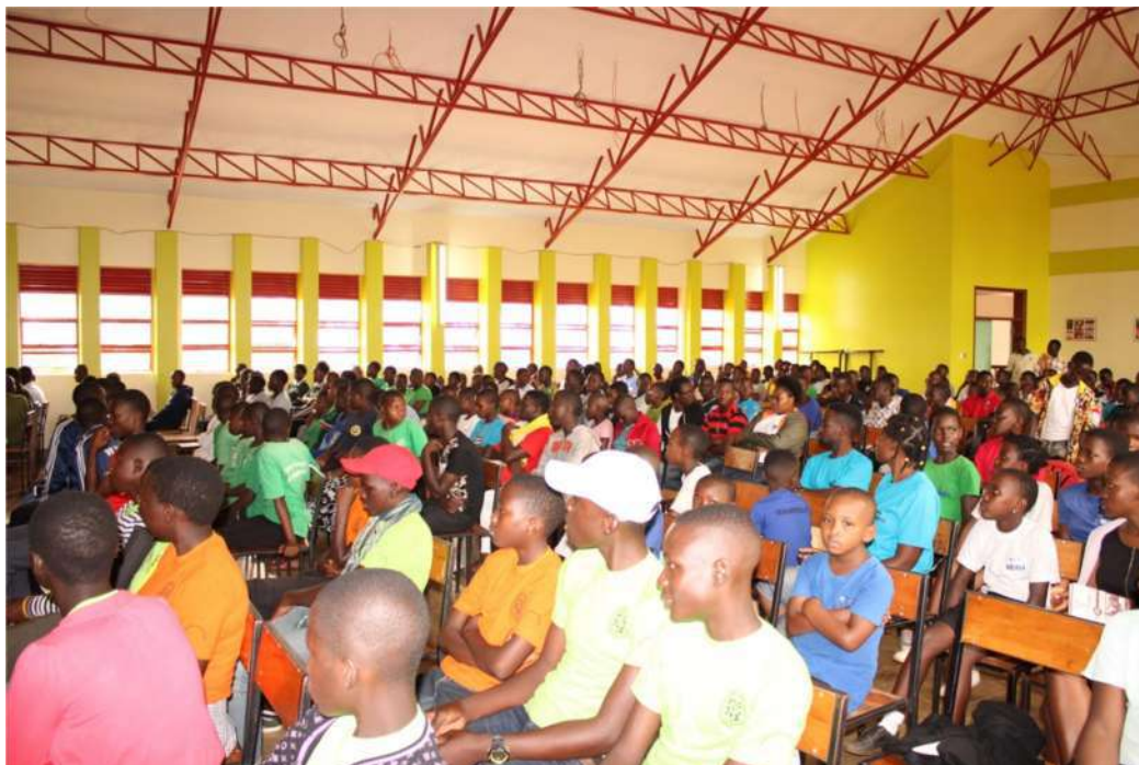
The opening ceremony was fully packed.