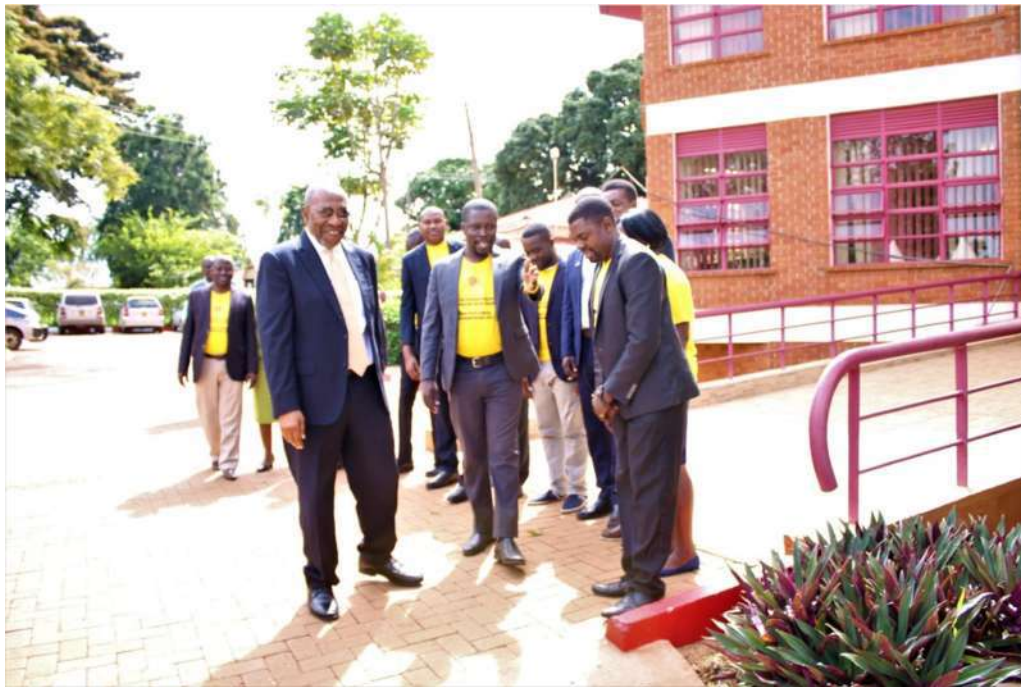
Guest of Honor ushered to the high table.