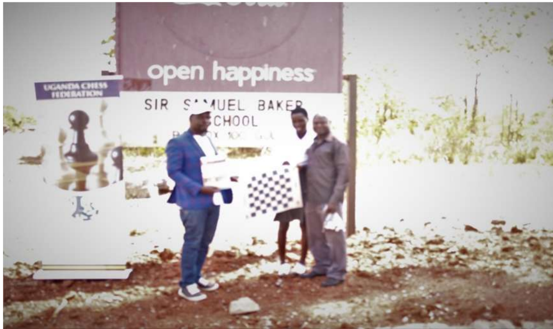
Sir. Samuel Baker school chess patron receives chess equipment.