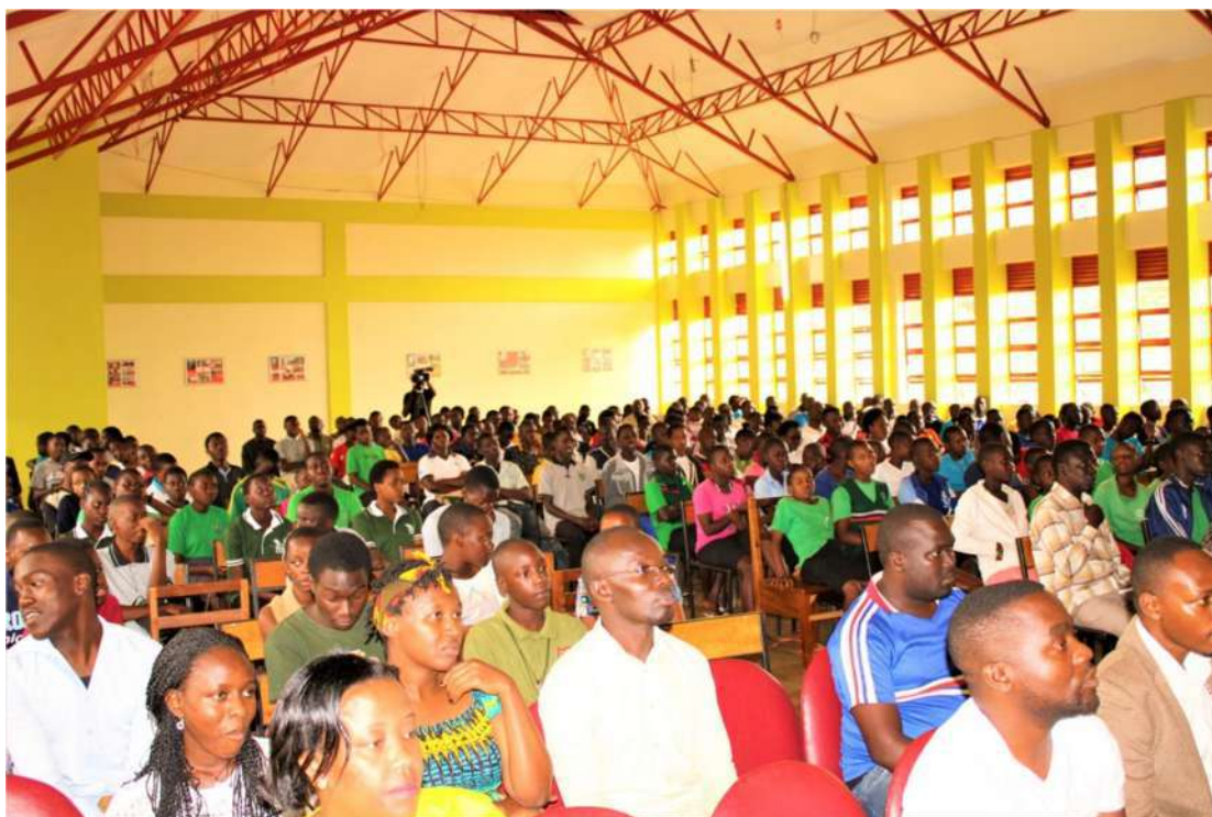
The multitude of participants at the 2019 edition of the Fr. Grimes national school chess championship.