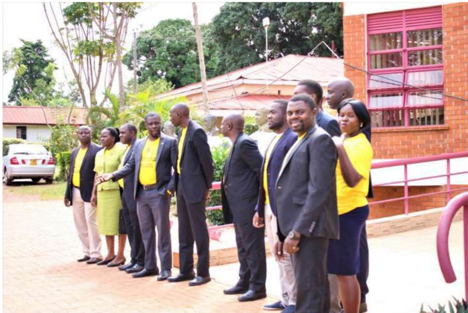
Parade to receive the guest of honor.