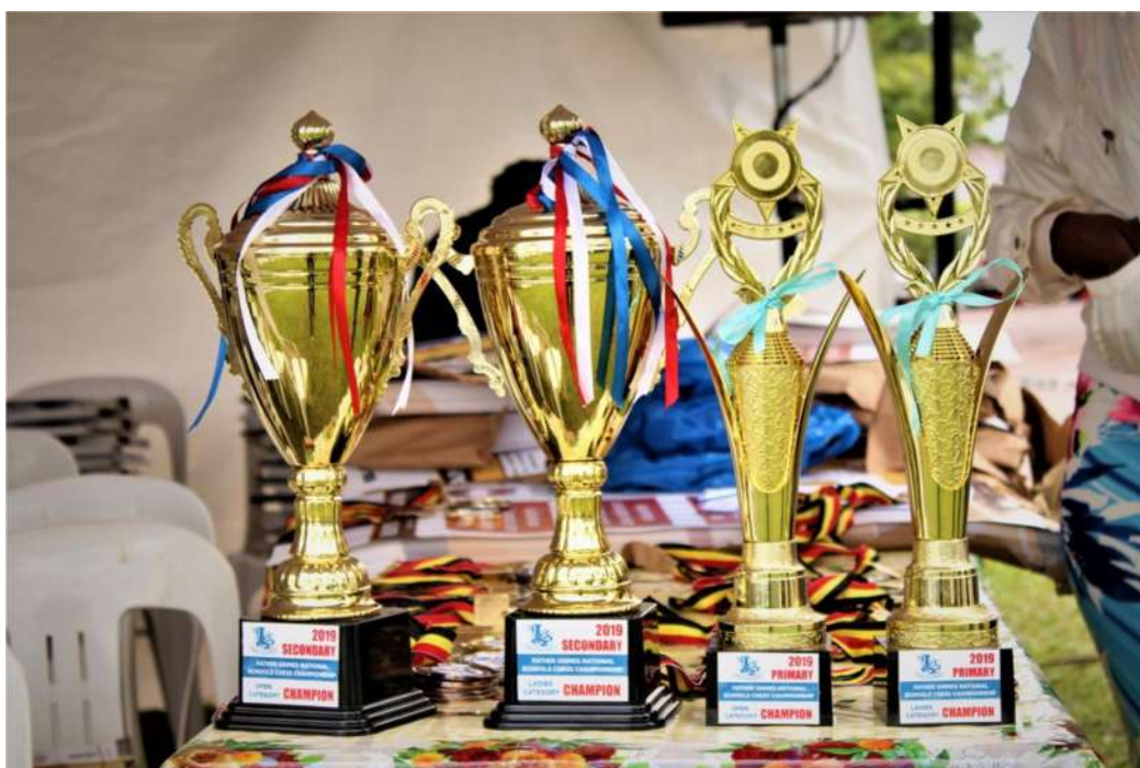
Trophies for the overall winners in the different categories.