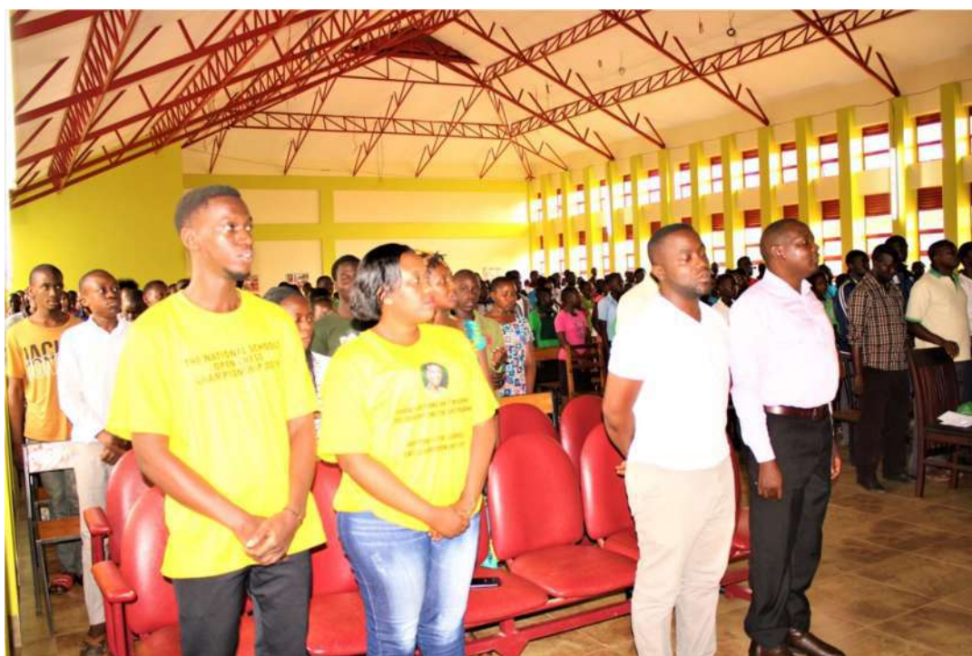
Prayer and the national anthem kicked off the opening ceremony.