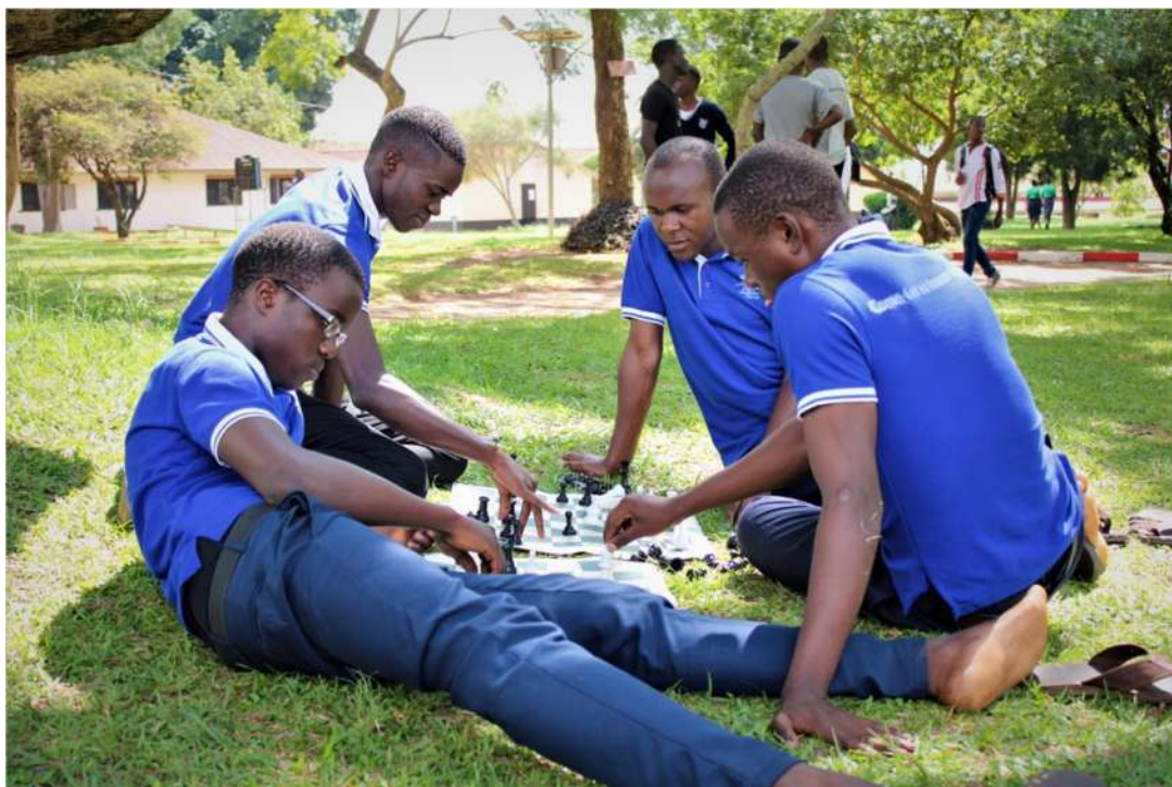
Students of Springfield undergoing training.