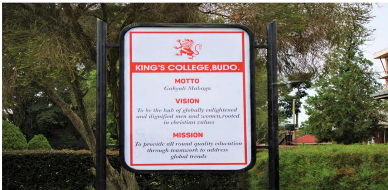
The Motto , Vision and mission of King’s College Budo.