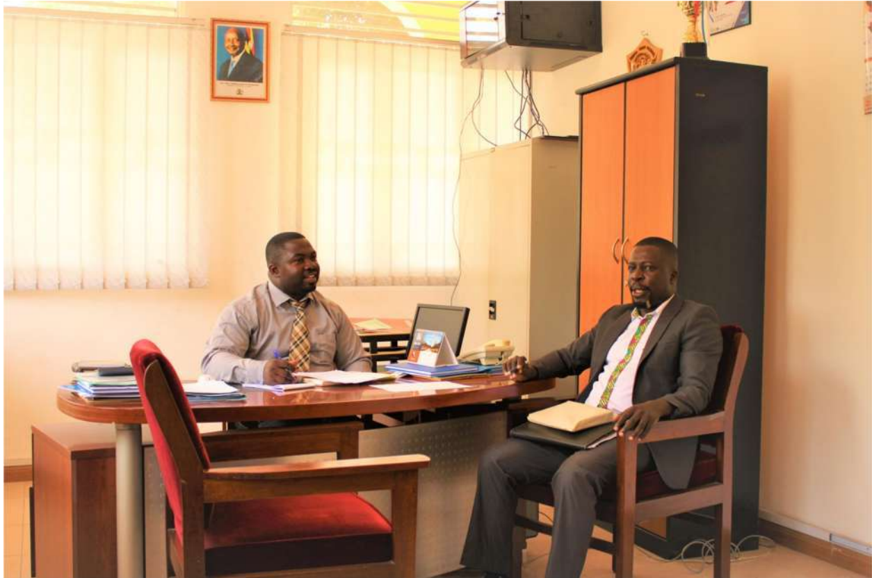
Head teacher of Seeta high School in Mukono having a discussion with UCF president.