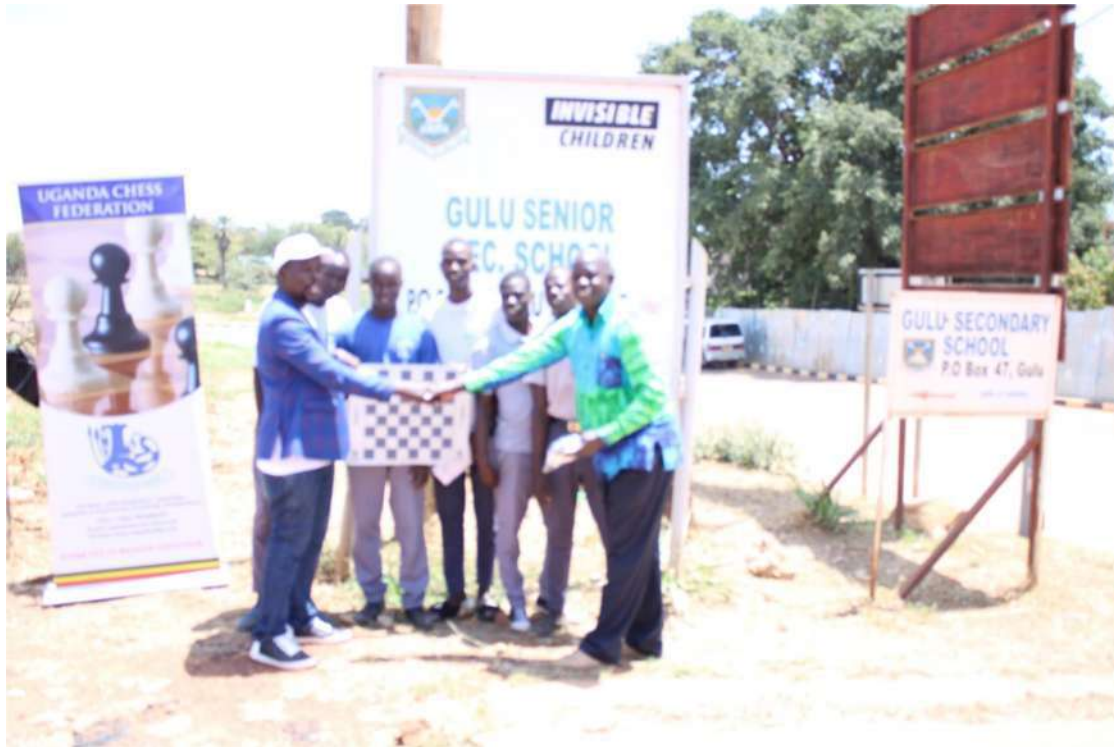
Gulu Senior secondary school share a picture moment with UCF president as they receive some chess equipment.