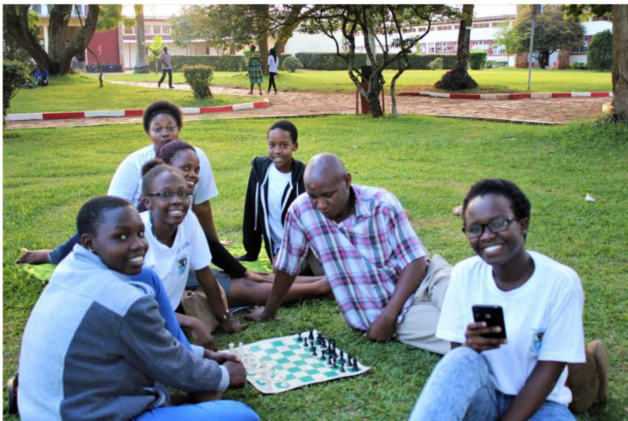
Students of Mary Hill High School undergoing a chess training session with their patron.