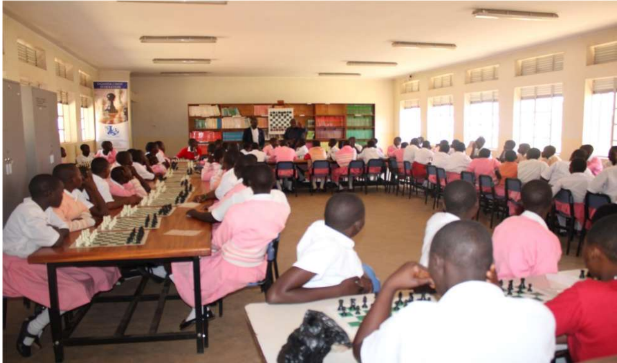
Players training at sacred heart secondary school in Gulu, Northern Uganda.

Prior to the 2019 edition of the Fr. Grimes chess Championship, UCF purposefully continued to promote, introduce and invite several persons to join chess in northern Uganda. Under the theme "one million chess players one million Smart minds", several schools in northern Uganda were visited and the game taught, promoted and in some instances introduced. The players and school administrators were welcoming and eager to join forces with UCF to promote the Chess Game.