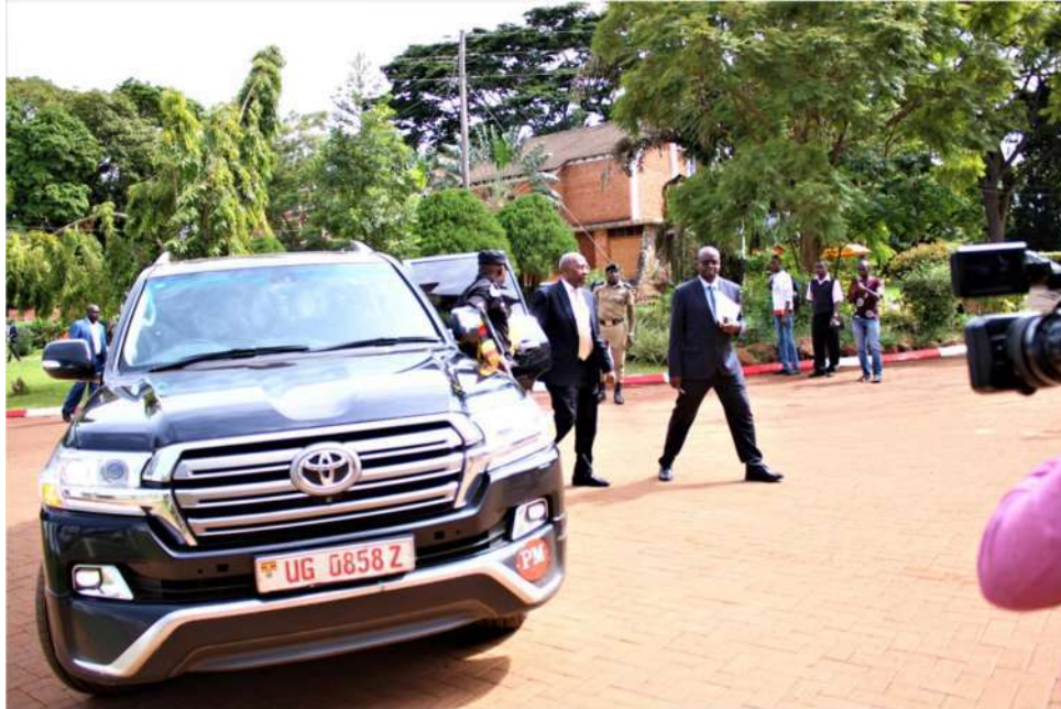
Arrival of Guest of honor in the parking area of the administration building in King's college Budo.

The long wait was over when Rt Hon. Dr. Ruhankana Rugunda the prime minister of the republic of Uganda arrived at Kings college Budo amid tight security. UCF executive members and Leadership from the hosts King's College Budo paraded to receive the guest of honor.