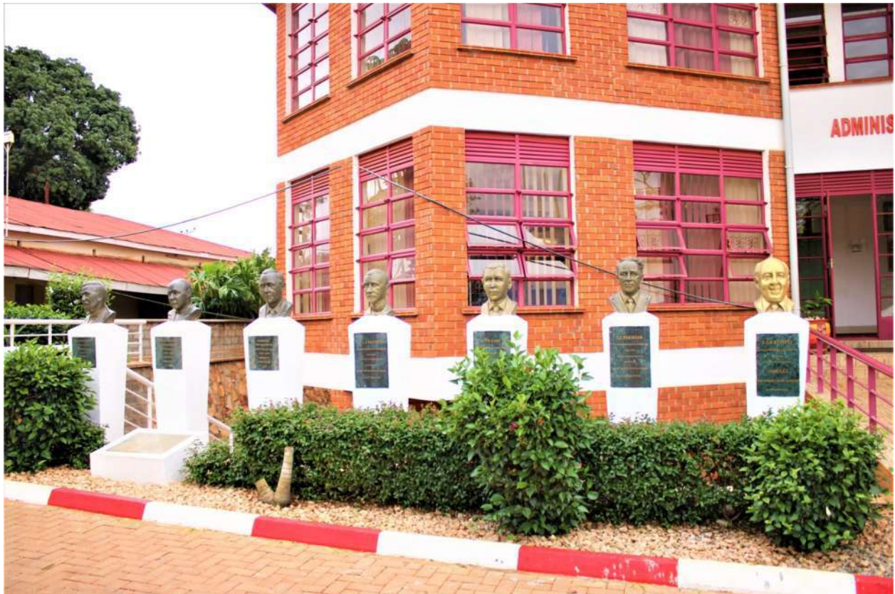
The magnificent administration block showing monuments of different former head teachers of the School.