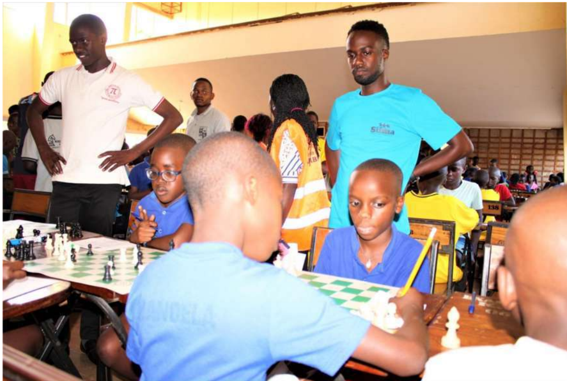
The primary section