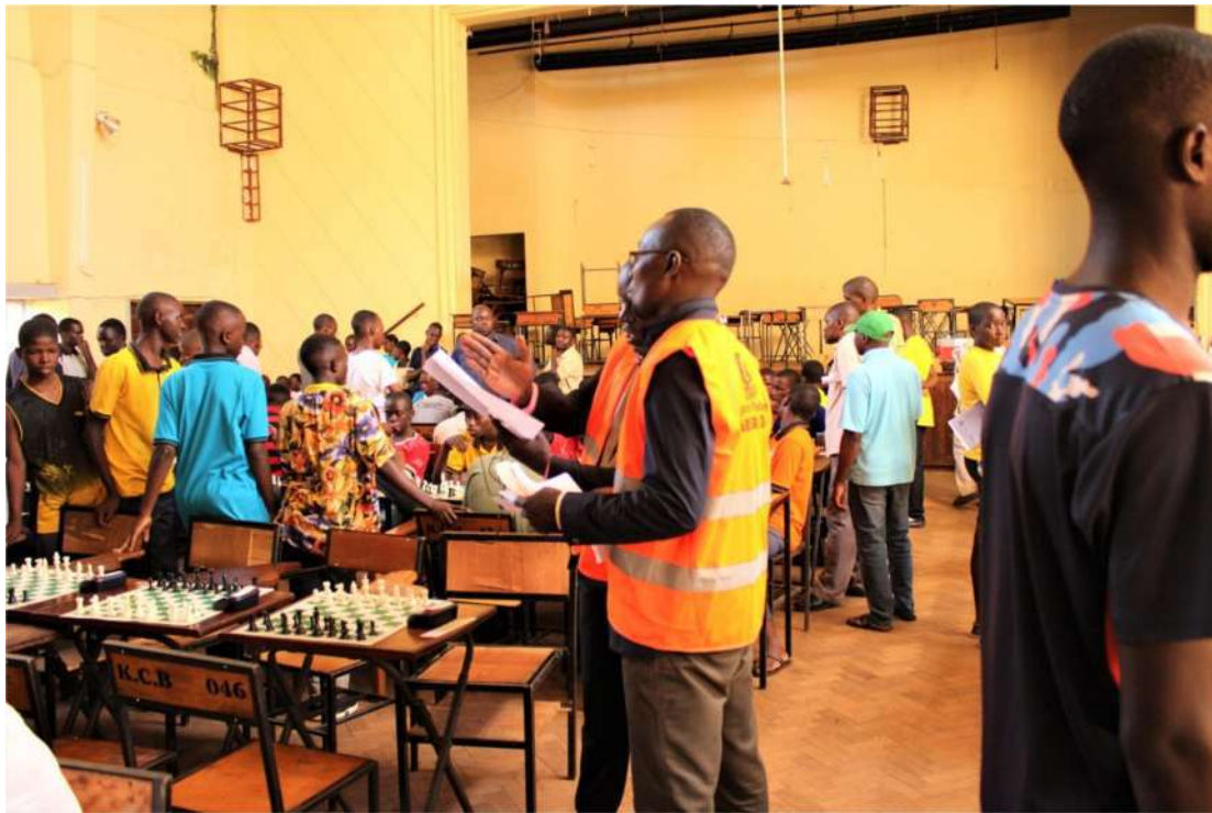
Open section secondary school