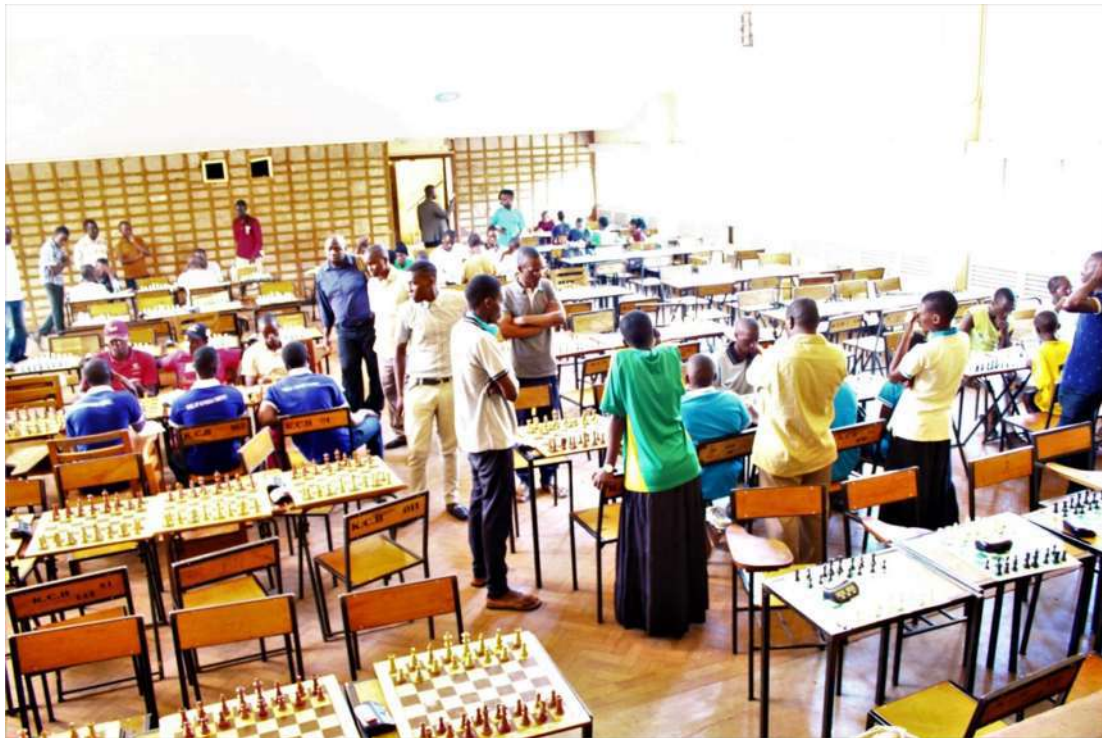
The playing area in King's College Budo.