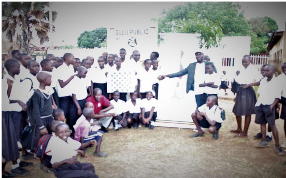
Gulu public school students receiving chess equipment