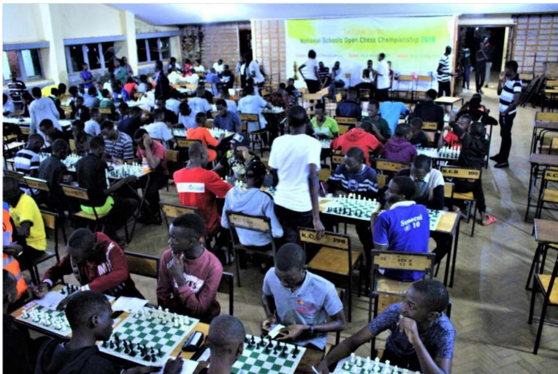
The playing area in King's College Budo.