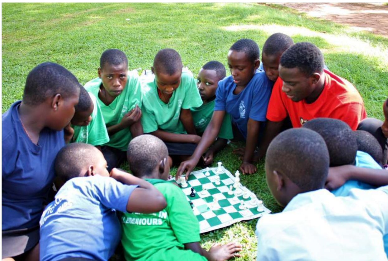
Chess instructor guiding students during a training session.