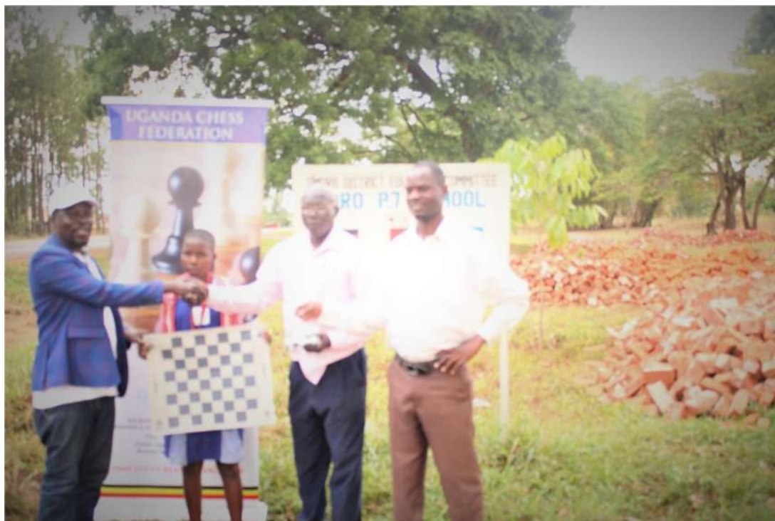
Head teacher of Koro P.7 Primary school in Gulu receiving chess equipment.