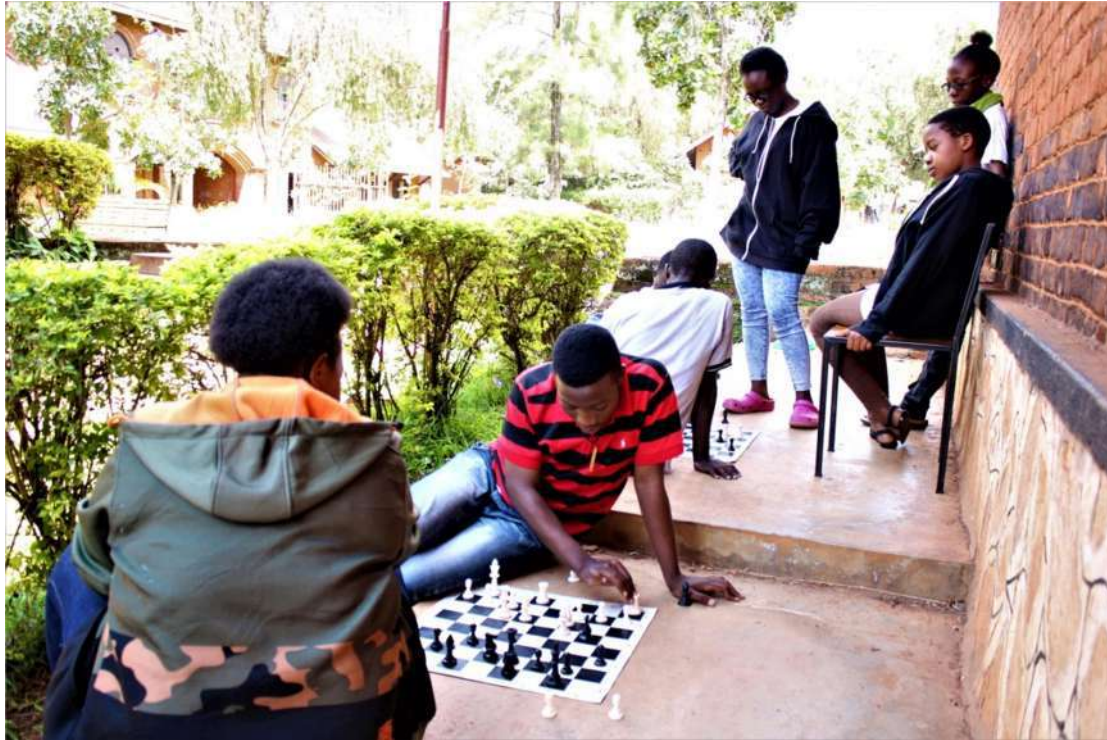
Training at the verandah of some buildings.