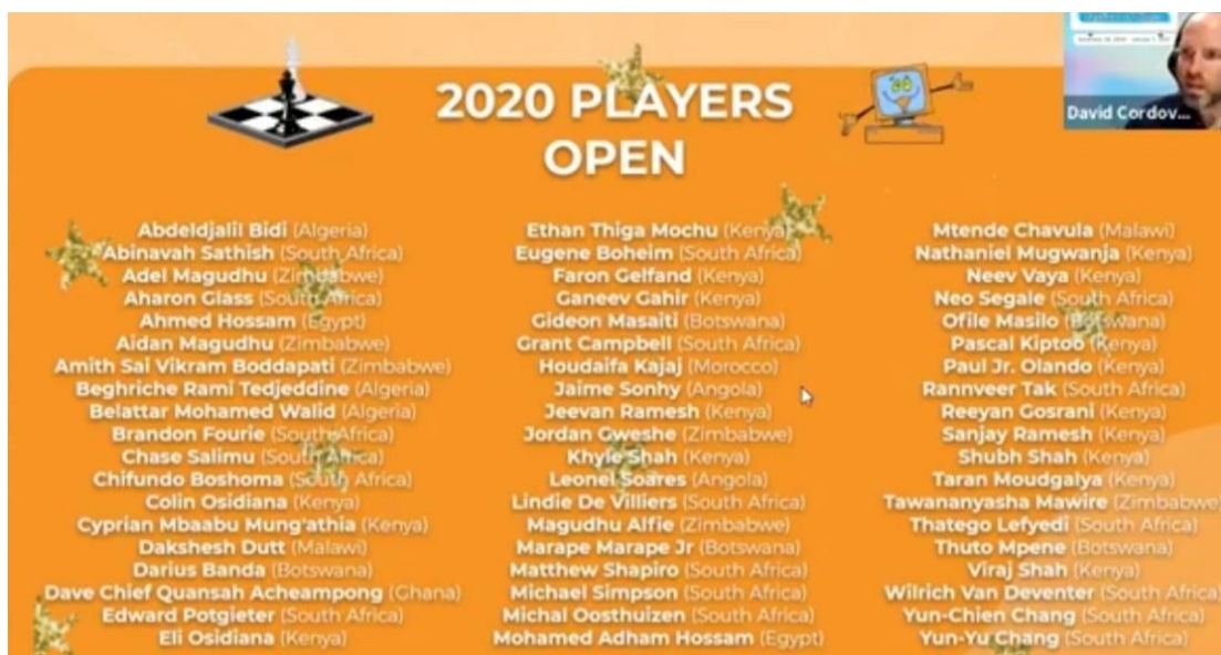
Screenshot of Open Section Entries

Due to the lower-than-expected number of registered entries in the designated age groups, the 105 players were split into two combined sections: Open (57 players) and Girls (48 players).