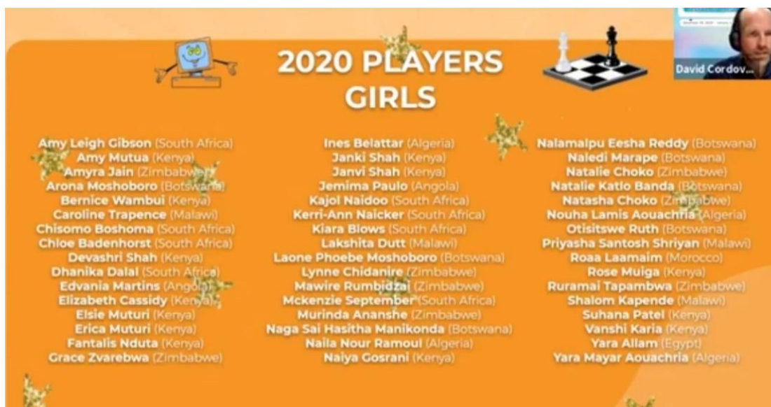
Screenshot of Girls Section Entries

The 105 players from 10 Federations were registered as follows: Kenya (30), South Africa (26), Zimbabwe (14), Botswana (12), Algeria (7), Malawi (6), Angola (4), Egypt (3), Morocco (2), Ghana (1).