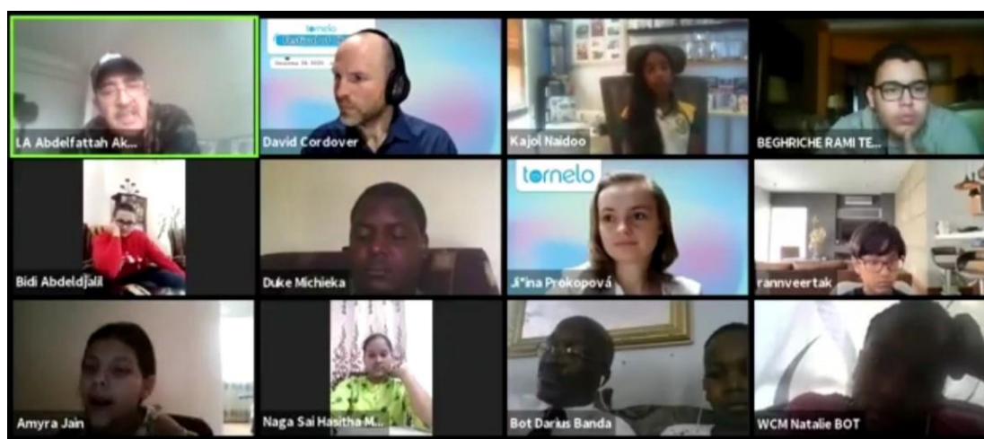
Screenshot of partial attendees of the Closing Ceremony

The 105 players from 10 Federations were registered as follows: Kenya (30), South Africa (26), Zimbabwe (14), Botswana (12), Algeria (7), Malawi (6), Angola (4), Egypt (3), Morocco (2), Ghana (1).