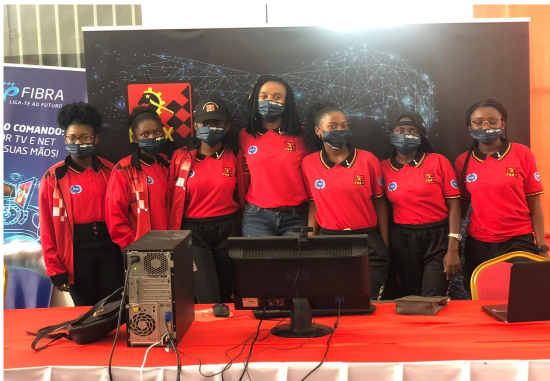
Dominant Angolans crowned as the 2020 Zone 4.5 Online Team Chess Champions