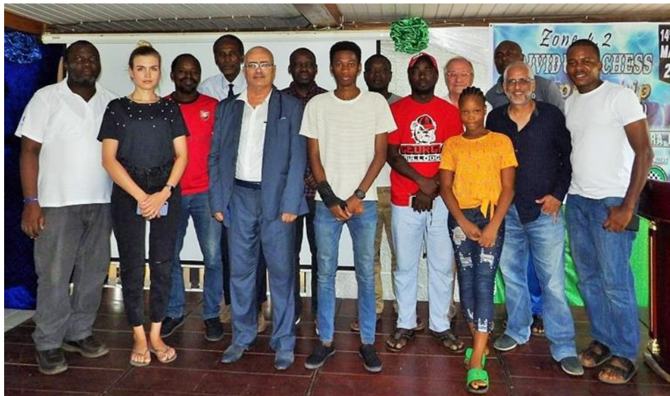
Group photo of officials and players

The 2020 Zone 4.2 Individual Chess Championships were held in the Sierra Leone Capital, Freetown from March 14 th , 2020 (arrival) to March 22 nd , 2020 (departure).