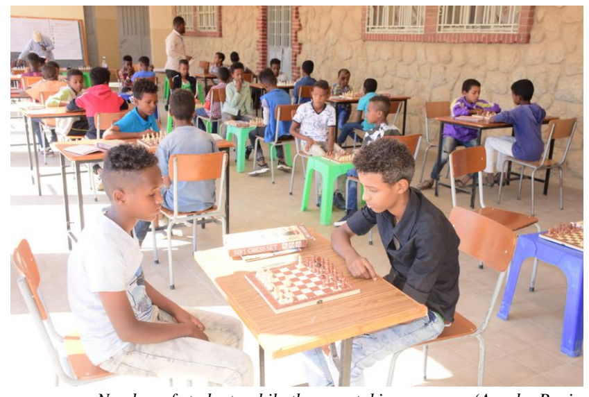
Number of students while they are taking a course (Anseba Region)

Technic Committee Head in the Eritrean National Chess Federation will giving a basic course of chess to students