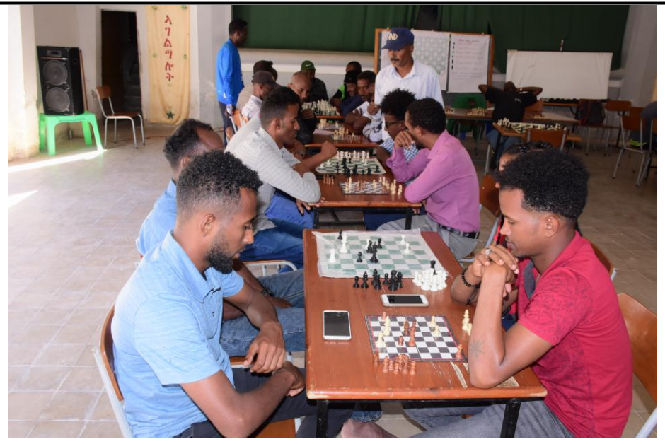
Number of physical education teachers while they are taking a course

- Other course has been conducted by the some tutors has been conducted to the physical Education teachers in the school of the region. The number of the physical education teachers who took the course was 36 teachers, among them was 2 females. The Course also took a part in October 20 - 30, 2020. The outcome of the course is to implement chess games and chess education in all schools in the region.