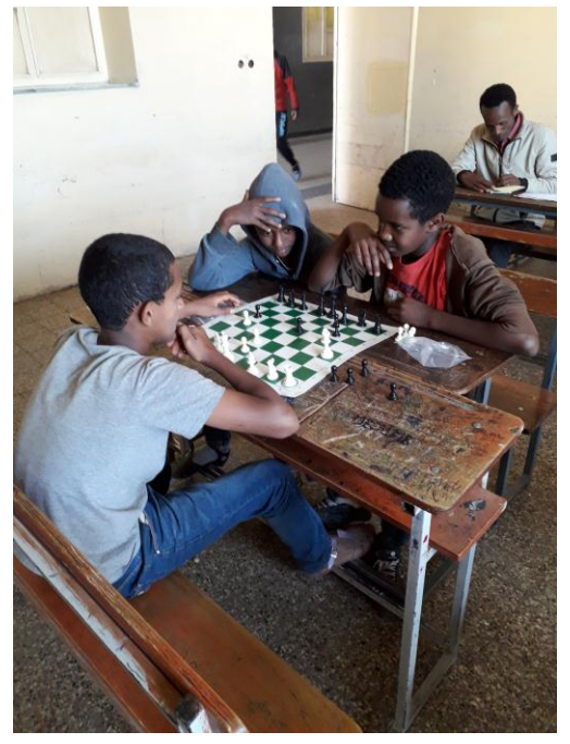
Number of students while they are taking a course (Asmara)

- Other course has been conducted by the some tutors has been conducted to the physical Education teachers in the school of the region. The number of the physical education teachers who took the course was 36 teachers, among them was 2 females. The Course also took a part in October 20 - 30, 2020. The outcome of the course is to implement chess games and chess education in all schools in the region.