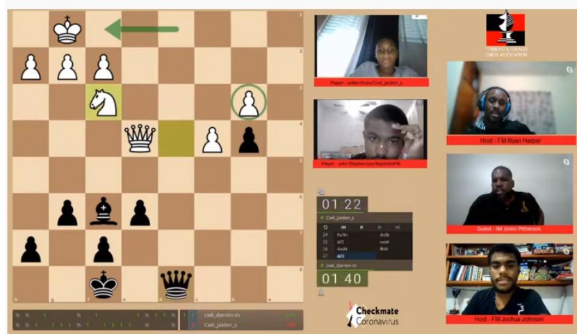
Live commentary of one of the online chess matches.

The TTCA hosted the 1 st Regional Online Chess Championship over the period June 13-17, 2020. This was a blitz event for Under 18 youth with an ELO less than 1800. Each game was 3 minutes with 2 sec increment after the first move.