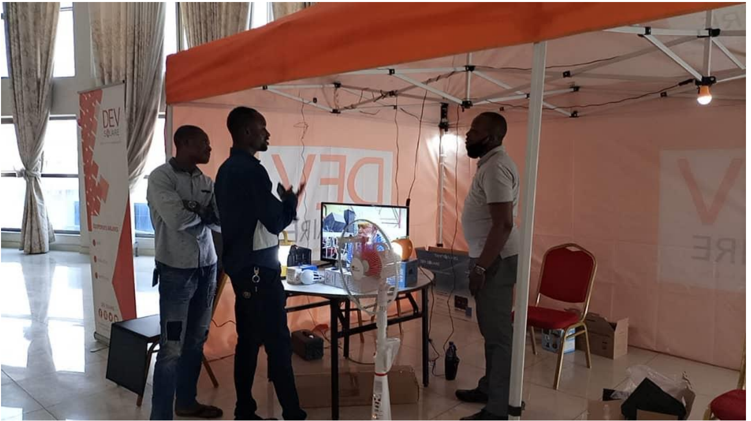
DEV SOLAIRE RD Congo at the Kinshasa City Hall