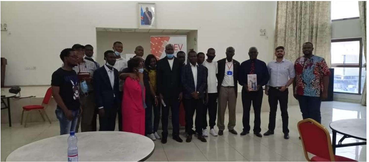
Group photo at the close of the Tournament on July 20, 2021 at the Kinshasa City Hall