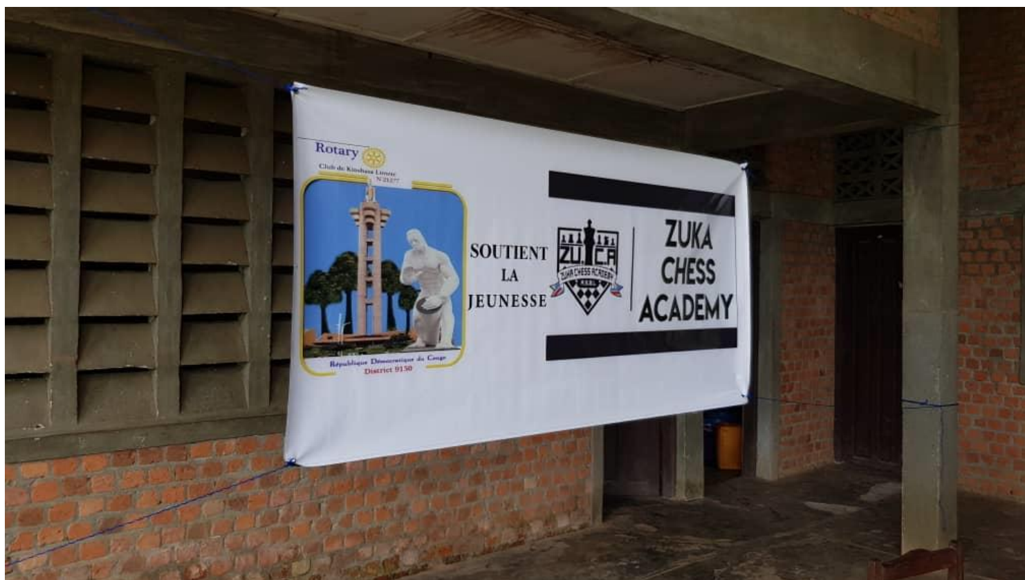
Support from Rotary International for the Ngeba Tournament