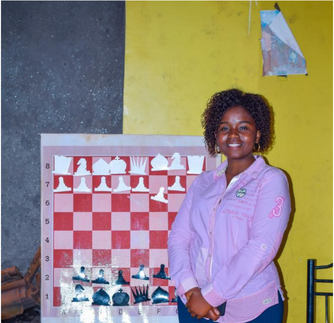
Chess Animator at the Orphanage of Goma