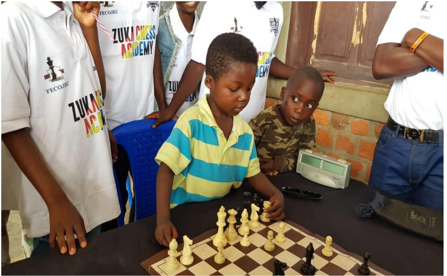
Young chess player participating in the Ngeba tournament