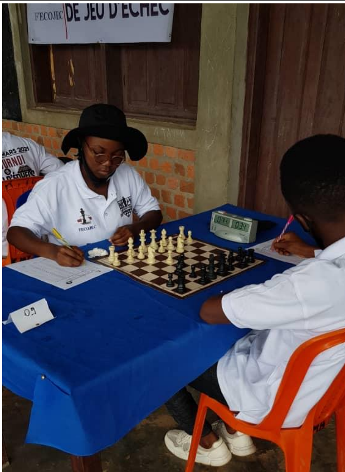
Kisantu chess player participating in the Ngeba tournament.