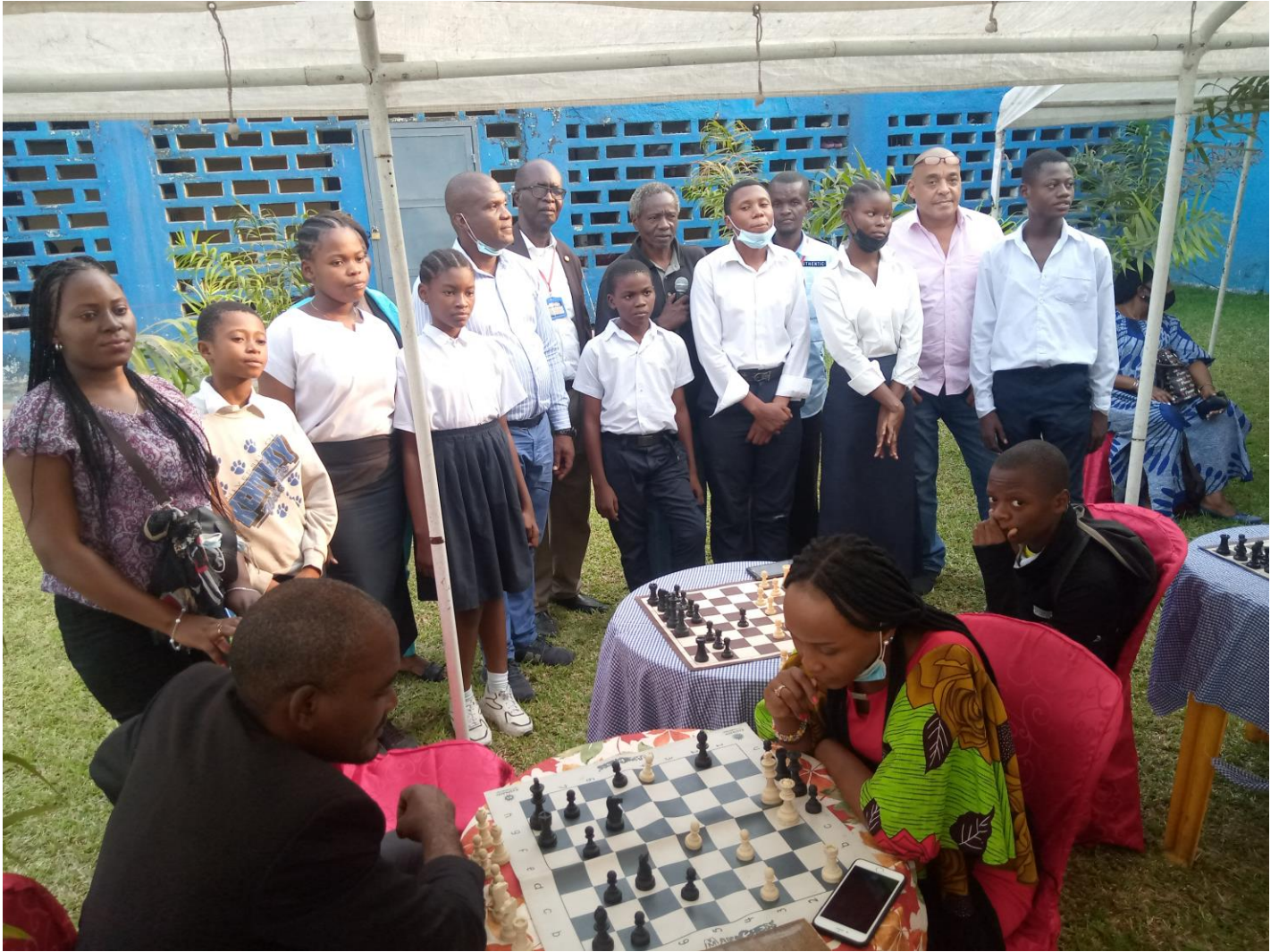
Open Day on July 20, 2021 in the YMCA Sports Center at Kinshasa