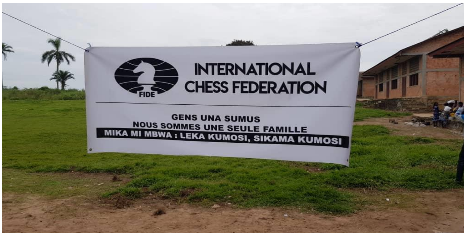
FIDE support for the Ngeba Tournament in rural areas at Kongo Central, March 27-28, 2021