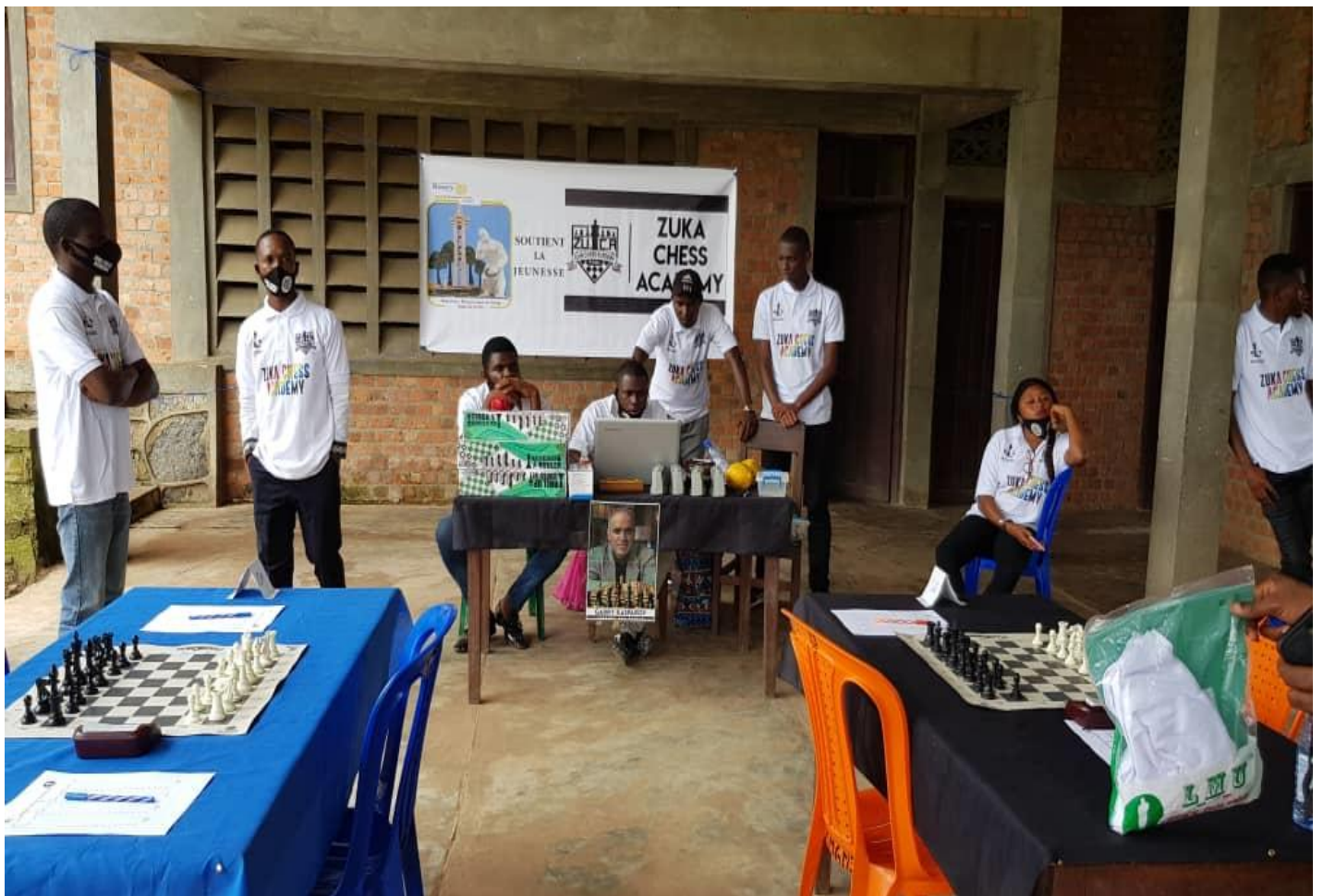
Ngeba Tournament Arbitration Office at Kongo Central