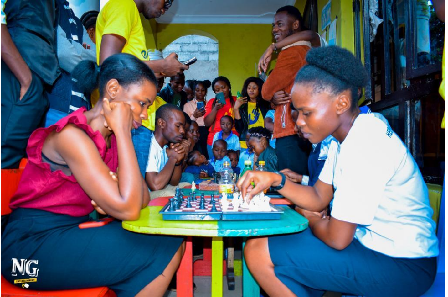
Chess players in the Goma Orphanage