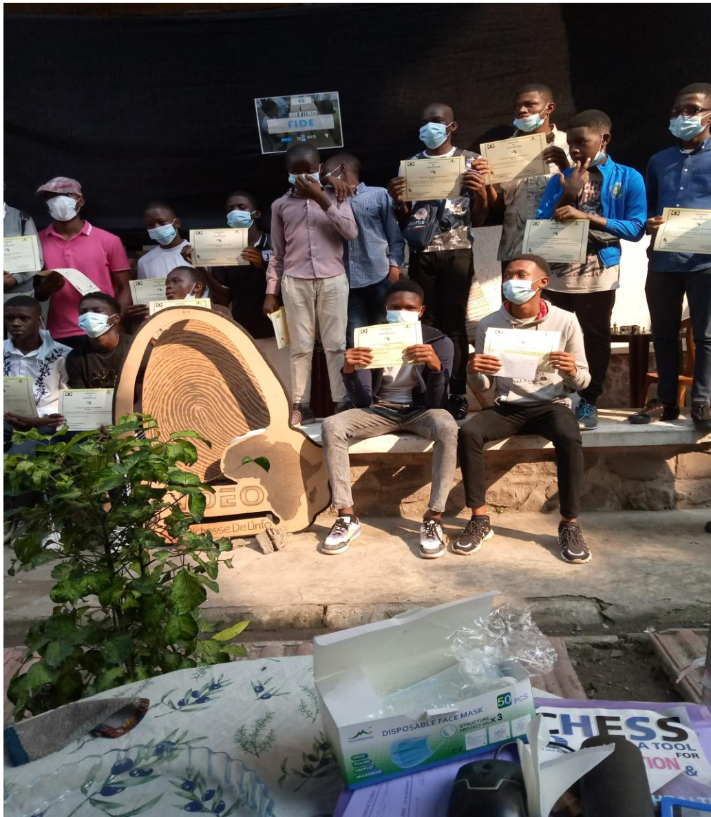
Kinshasa junior players presenting their participation certificate.