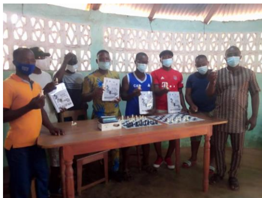
Last day learning how to use chess clock and the Closing ceremony