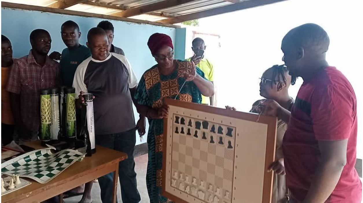
Chess Federation of Zambia donating chess sets and demonstration boards at Zambia Institute of Special Education school

This will give more players with disabilities the opportunity to compete at an international events, representing our country.