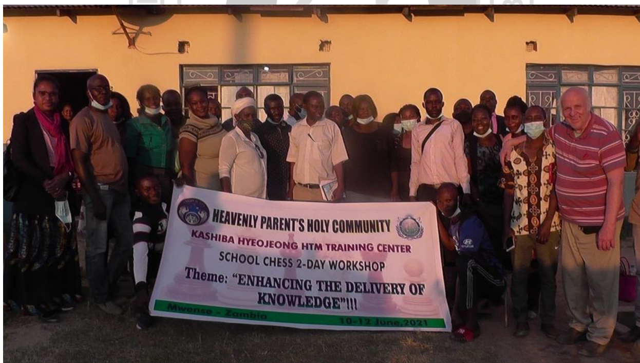
Chess In Education in Kashiba