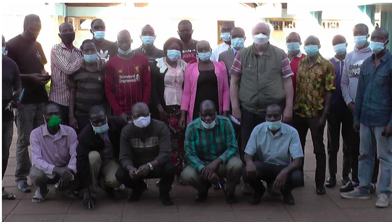
Chess In Education participants in Chipata