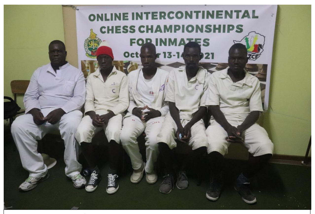
Zimbabwe Inmates team for the FIDE Intercontinental Online Chess Championships