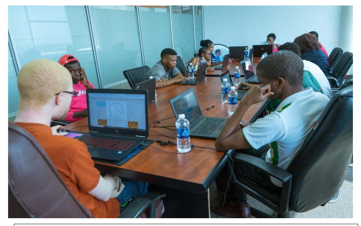
Zimbabwe Team playing the Africa Zone 4.5 Online 4 Nations Cup at Joina City Building, in Harare