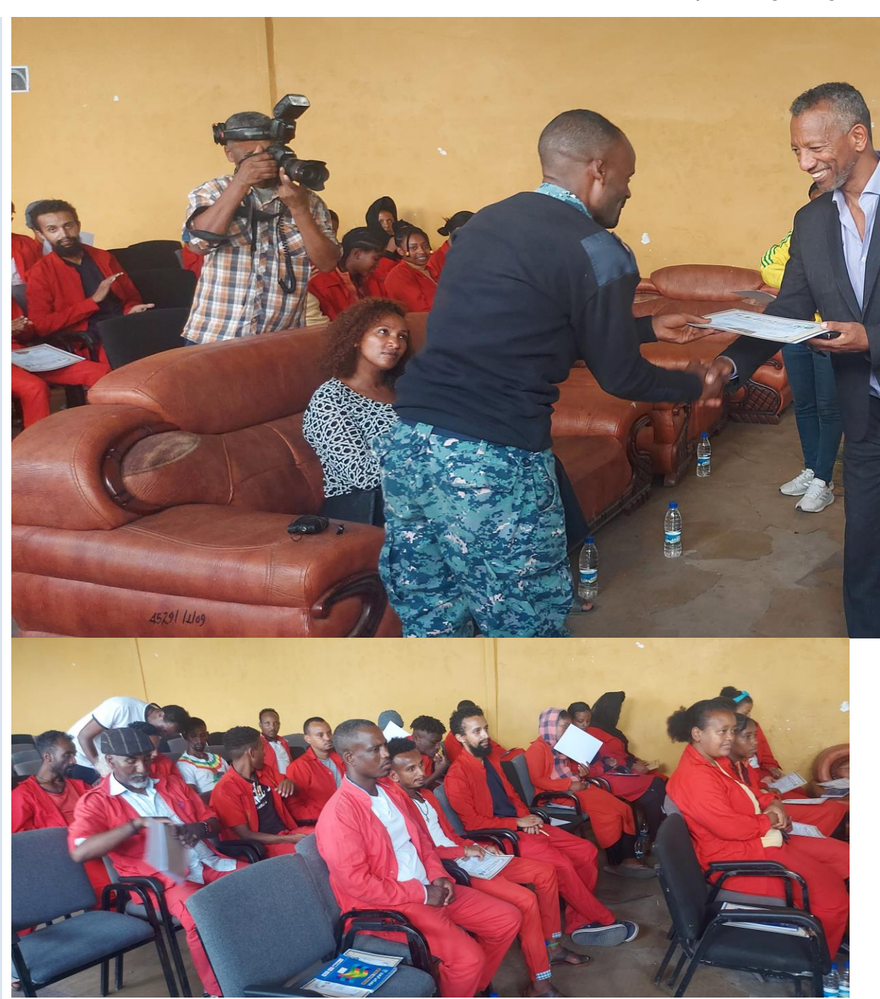
Basic Chess Training for prisoners and Community service workers