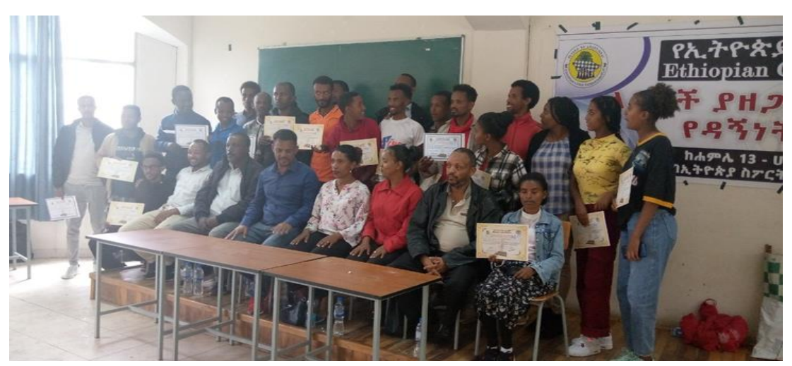
2<sup>nd</sup> level Training for Coaches and Arbiters July 2023 Addis Ababa