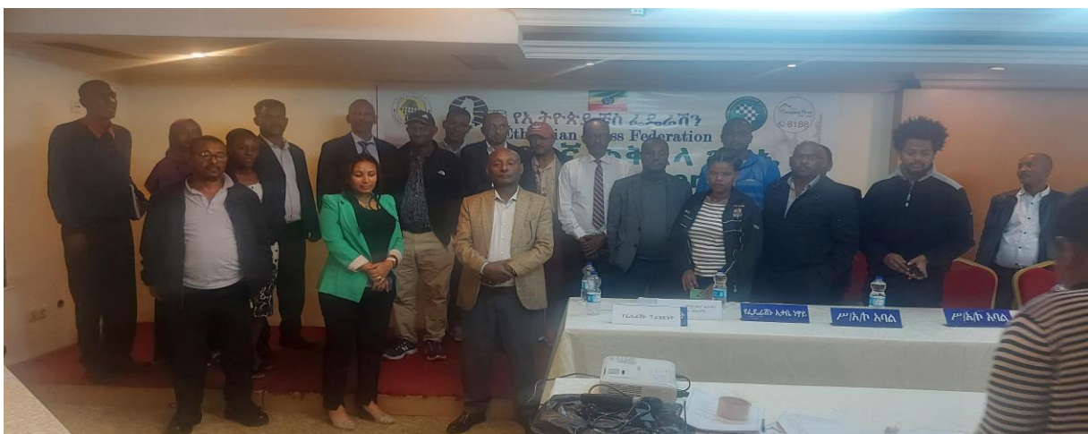
19 th General Assembly March 2023 Addis Ababa