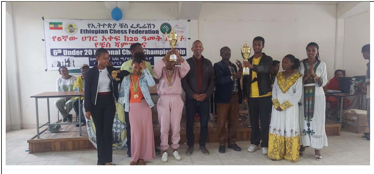
2023 Under 20 Chess Championship April 2023 Addis Ababa