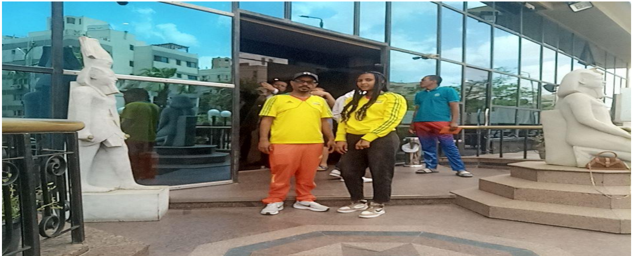
2023 Africa individual Chess Championship National Team May 2023 EGIPT