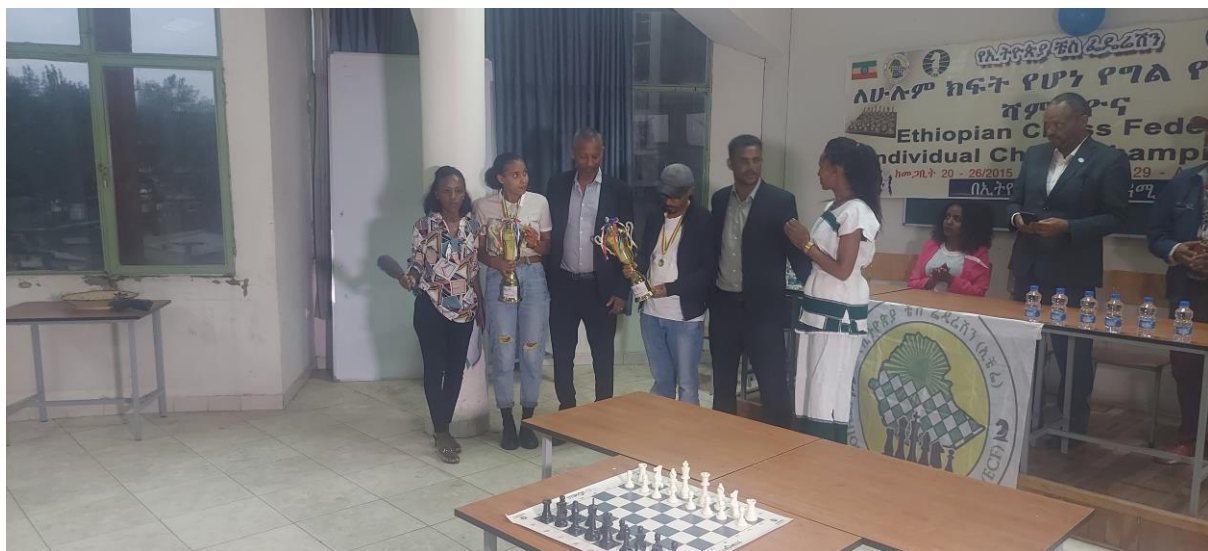
2023 National individual Chess Championship April 2023 Addis Ababa