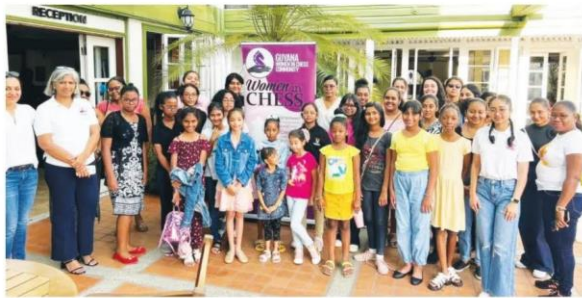
Scenes from the Queenside Girls and Women Chess Camp

The annual event attracted more than 50 girls