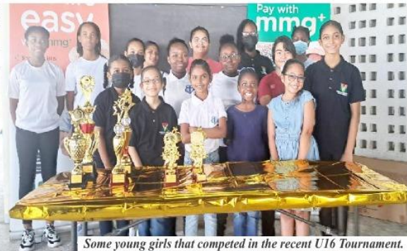
Some young girls that competed in the recent U16 Tournament.

of "The Queen Side" Girls Chess Camp is to create a supportive and welcoming environment for young female chess players. Chess in Guyana has long been a male-dominated sport, and it can be intimidating for girls to participate in more formal settings such as tournaments or training sessions, especially when they are just