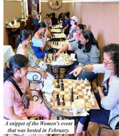
A snippet of the Women's event that was hosted in February.

The provision of women-only spaces can play an important role in keeping a