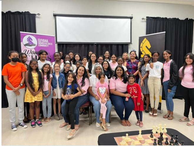
Tuesday August 22, 2023